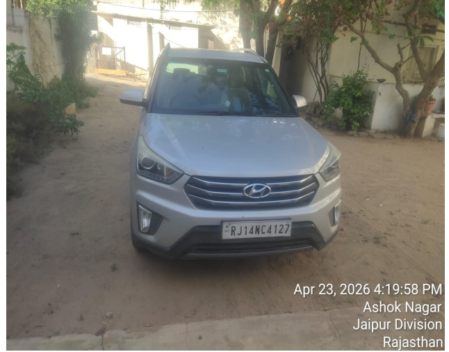
Apr 23, 2026 4:19:58 PM Ashok Nagar Jaipur Division Rajasthan