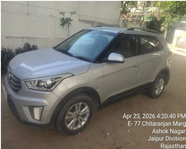
Apr 23, 2026 4:20:40 PM E- 77 Chitaranjan Marg Ashok Nagar Jaipur Division Rajasthan