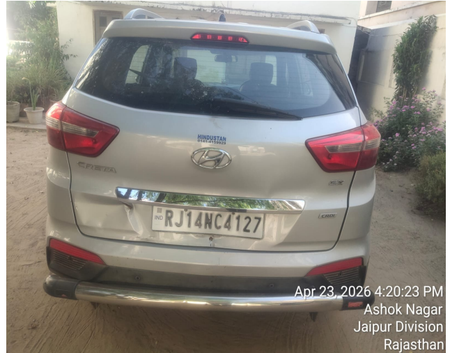
Apr 23, 2026 4:20:23 PM Ashok Nagar Jaipur Division Rajasthan