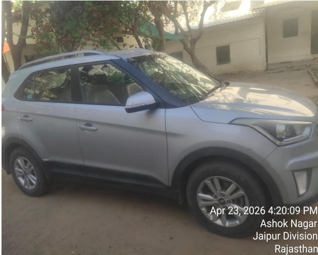
Apr 23, 2026 4:20:09 PM Ashok Nagar Jaipur Division Rajasthan