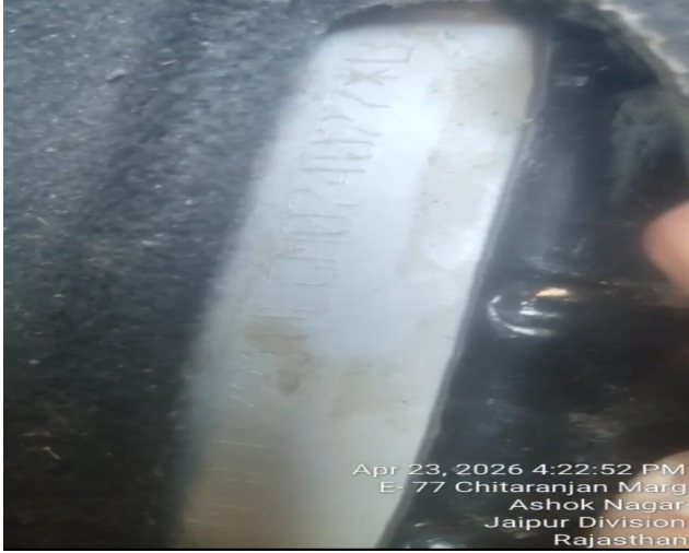
Apr 23, 2026 4:22:52 PM E- 77 Chitaranjan Marg Ashok Nagar Jaipur Division Rajasthan

Surveyor & Loss Assessor (SLA / 65869 Valid up to 27-09-27)