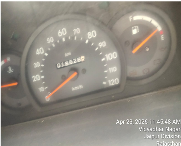
Apr 23, 2026 11:45:48 AM Vidyadhar Nagar Jaipur Division Rajasthan