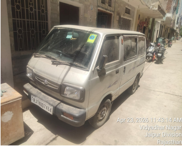
Apr 23, 2026 11:43:14 AM Vidyadhar Nagar Jaipur Division Rajasthan

Surveyor & Loss Assessor (SLA / 65869 Valid up to 27-09-27)