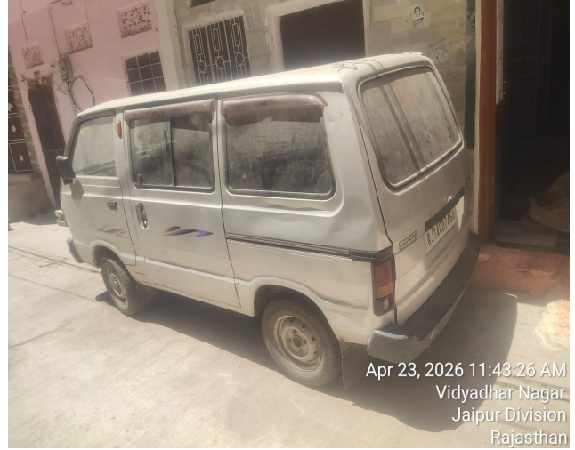
Apr 23, 2026 11:43:26 AM Vidyadhar Nagar Jaipur Division Rajasthan