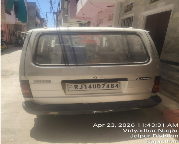
Apr 23, 2026 11:43:31 AM Vidyadhar Nagar Jaipur Division Rajasthan