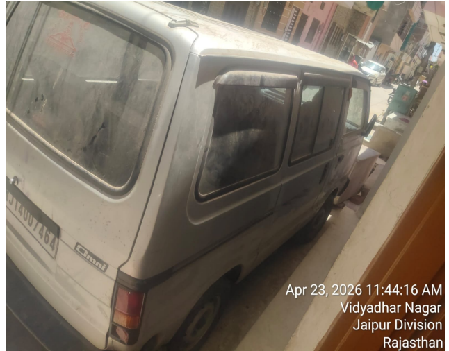
Apr 23, 2026 11:44:16 AM Vidyadhar Nagar Jaipur Division Rajasthan