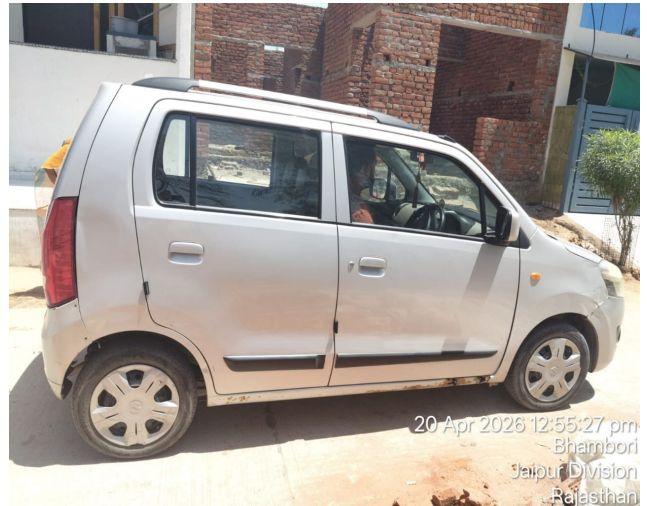
20 Apr 2026 12:55:27 pm Bhambori Jaipur Division Rajasthan