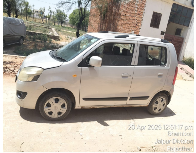
20 Apr 2026 12:51:17 pm Bhambori Jaipur Division Rajasthan