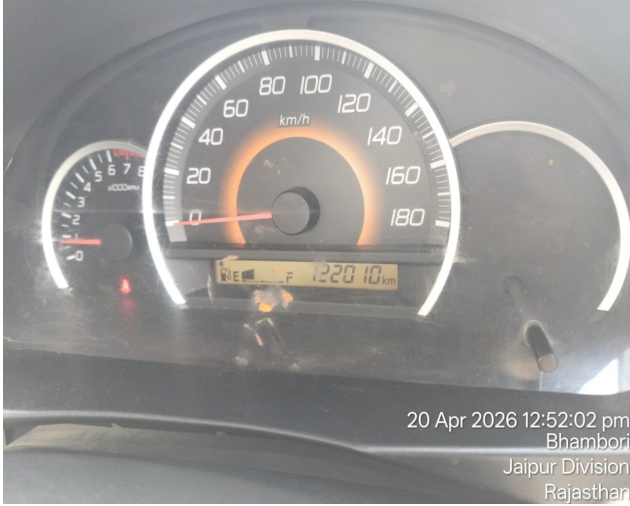
20 Apr 2026 12:52:02 pm Bhambori Jaipur Division Rajasthan

Surveyor & Loss Assessor (SLA / 65869 Valid up to 27-09-27)