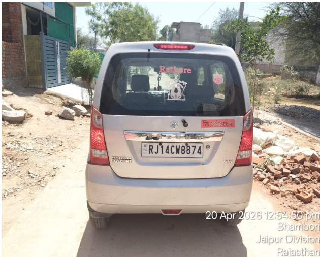
20 Apr 2026 12:54:50 pm Bhambori Jaipur Division Rajasthan