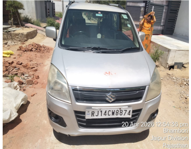
20 Apr 2026 12:54:36 pm Bhambori Jaipur Division Rajasthan