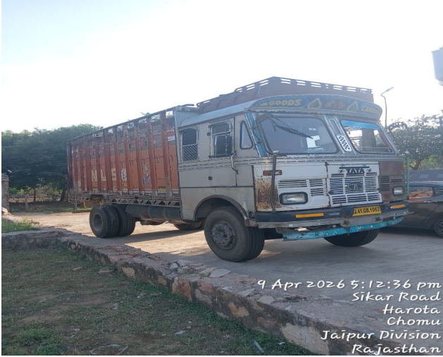
9 Apr 2026 5:12:36 pm Sikar Road Harota Chomu Jaipur Division Rajasthan

Surveyor & Loss Assessor (SLA / 65869 Valid up to 27-09-27)