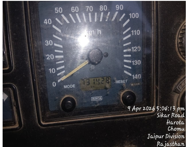
9 Apr 2026 5:04:13 pm Sikar Road Harota Chomu Jaipur Division Rajasthan