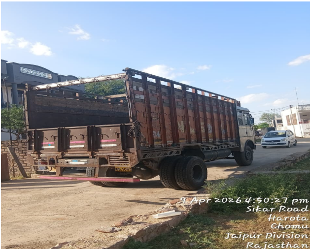
9 Apr 2026 4:50:27 pm Sikar Road Harota Chomu Jaipur Division Rajasthan