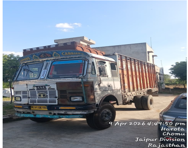
9 Apr 2026 4:49:50 pm Harota Chomu Jaipur Division Rajasthan