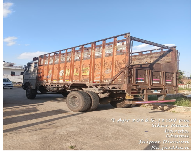
9 Apr 2026 5:12:04 pm Sikar Road Harota Chomu Jaipur Division Rajasthan