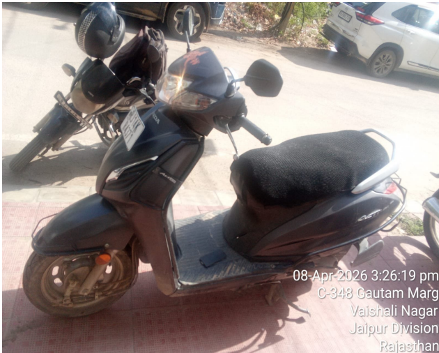
08-Apr-2026 3:26:19 pm C-348 Gautam Marg Vaishali Nagar Jaipur Division Rajasthan