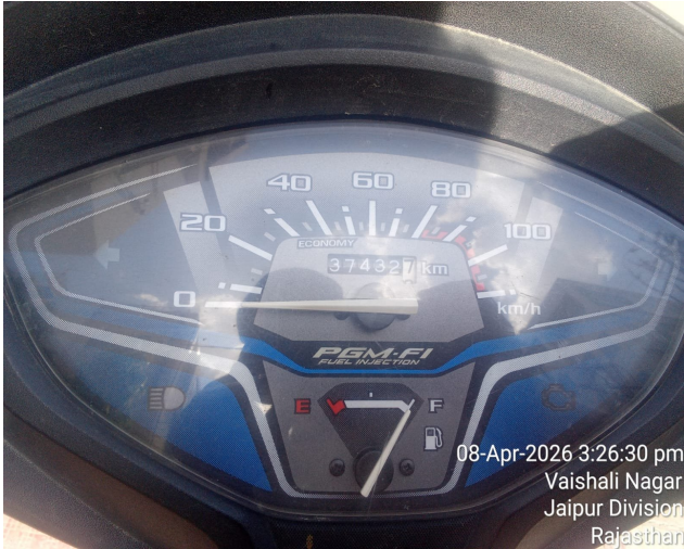
08-Apr-2026 3:26:30 pm Vaishali Nagar Jaipur Division Rajasthan