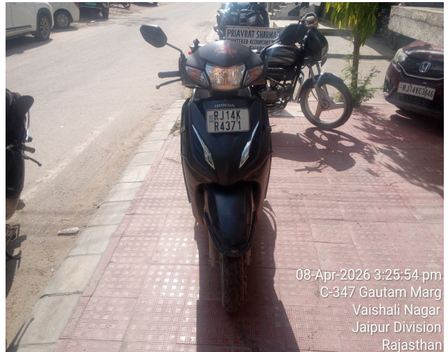
08-Apr-2026 3:25:54 pm C-347 Gautam Marg Vaishali Nagar Jaipur Division Rajasthan