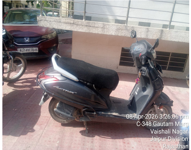
08-Apr-2026 3:26:06 pm C-348 Gautam Marg Vaishali Nagar Jaipur Division Rajasthan