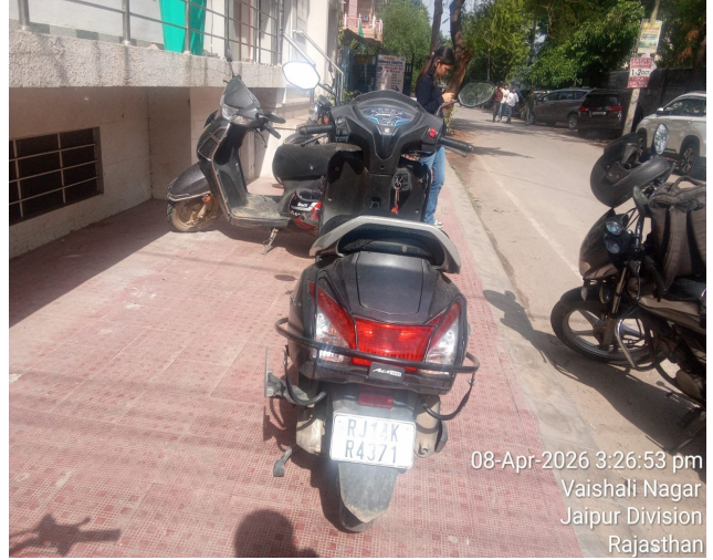
08-Apr-2026 3:26:53 pm Vaishali Nagar Jaipur Division Rajasthan