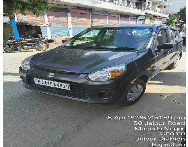
6 Apr 2026 2:51:39 pm 30 Jaipur Road Magadh Nagar Chomu Jaipur Division Rajasthan