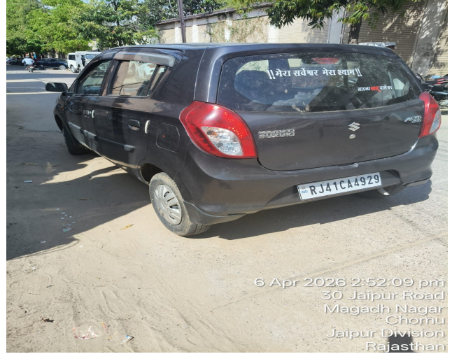
6 Apr 2026 2:52:09 pm 30 Jaipur Road Magadh Nagar Chomu Jaipur Division Rajasthan