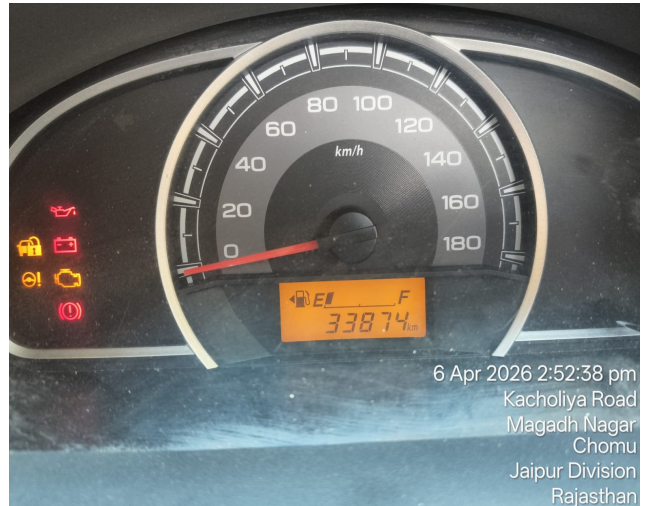
6 Apr 2026 2:52:38 pm Kacholiya Road Magadh Nagar Chomu Jaipur Division Rajasthan