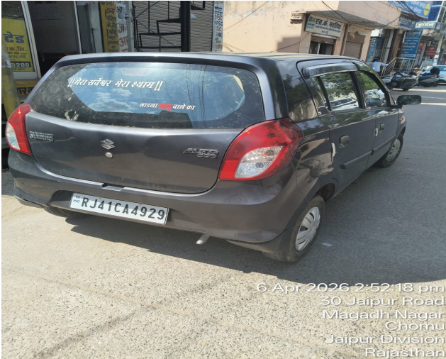
6 Apr 2026 2:52:18 pm 30 Jaipur Road Magadh Nagar Chomu Jaipur Division Rajasthan