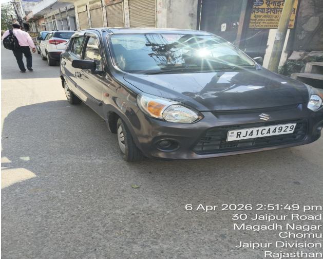
6 Apr 2026 2:51:49 pm 30 Jaipur Road Magadh Nagar Chomu Jaipur Division Rajasthan

Surveyor & Loss Assessor (SLA / 65869 Valid up to 27-09-27)