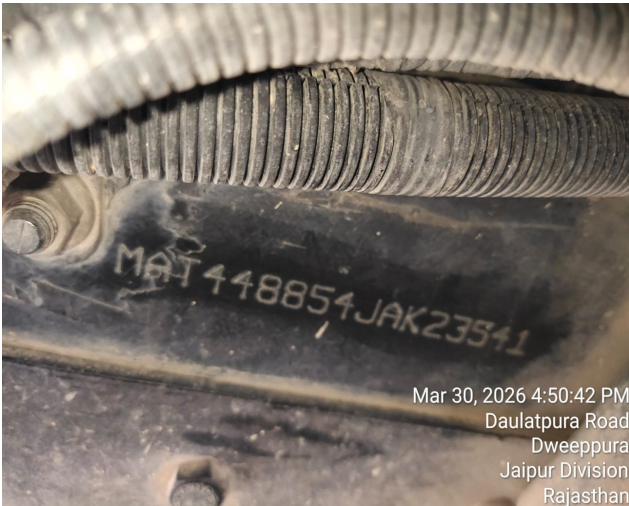
Mar 30, 2026 4:50:42 PM Daulatpura Road Dweeppura Jaipur Division Rajasthan