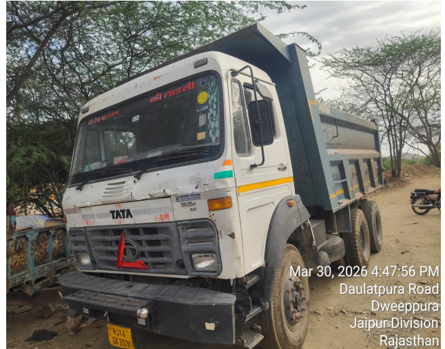
Mar 30, 2026 4:47:56 PM Daulatpura Road Dweeppura Jaipur Division Rajasthan