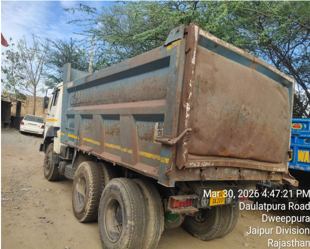
Mar 30, 2026 4:47:21 PM Daulatpura Road Dweeppura Jaipur Division Rajasthan