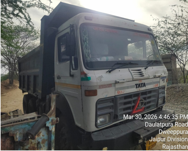
Mar 30, 2026 4:46:35 PM Daulatpura Road Dweeppura Jaipur Division Rajasthan

Surveyor & Loss Assessor (SLA / 65869 Valid up to 27-09-27)