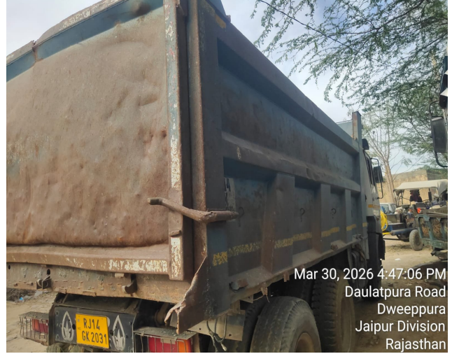
Mar 30, 2026 4:47:06 PM Daulatpura Road Dweeppura Jaipur Division Rajasthan