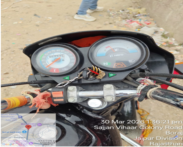
30 Mar 2026 1:36:21 pm Sajjan Vihaar Colony Road Boraj Jaipur Division Rajasthan

Surveyor & Loss Assessor (SLA / 65869 Valid up to 27-09-27)