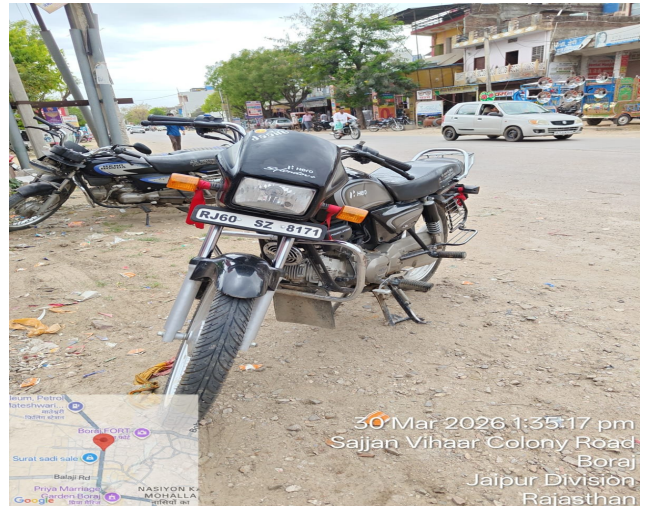
30 Mar 2026 1:35:17 pm Sajjan Vihaar Colony Road Boraj Jaipur Division Rajasthan