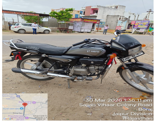
30 Mar 2026 1:36:11 pm Sajjan Vihaar Colony Road Boraj Jaipur Division Rajasthan