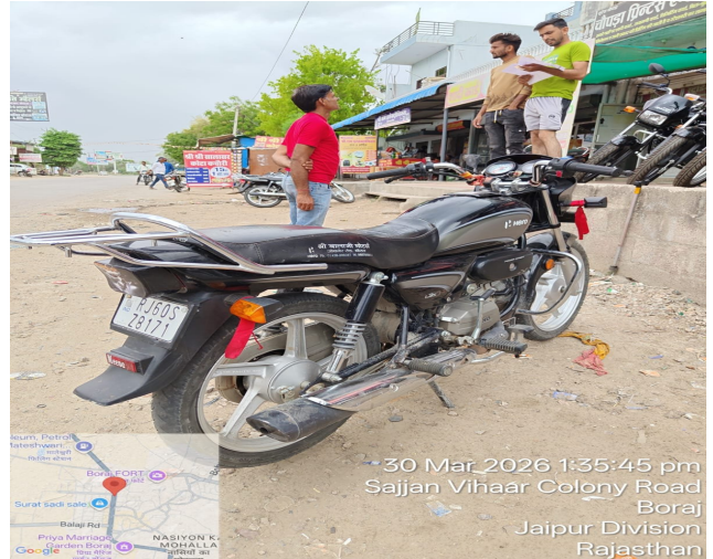
30 Mar 2026 1:35:45 pm Sajjan Vihaar Colony Road Boraj Jaipur Division Rajasthan