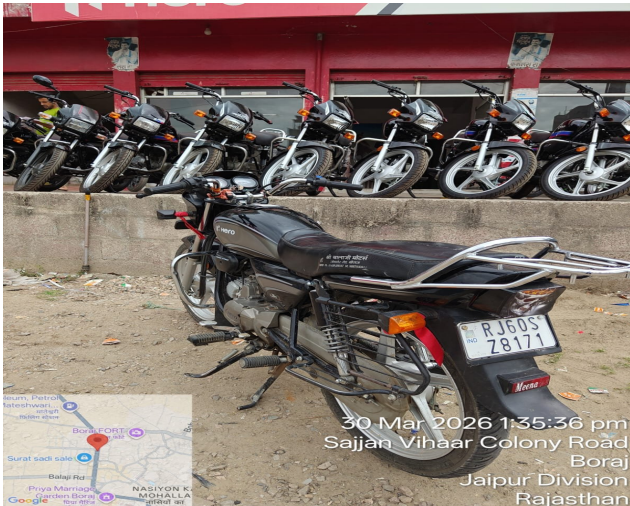
30 Mar 2026 1:35:36 pm Sajjan Vihaar Colony Road Boraj Jaipur Division Rajasthan