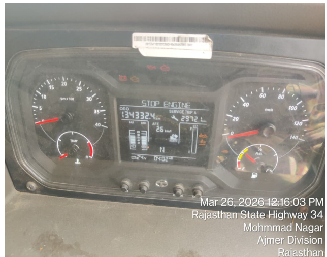
Mar 26, 2026 12:16:03 PM Rajasthan State Highway 34 Mohammad Nagar Ajmer Division Rajasthan