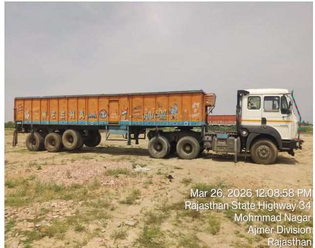
Mar 26, 2026 12:08:58 PM Rajasthan State Highway 34 Mohammad Nagar Ajmer Division Rajasthan