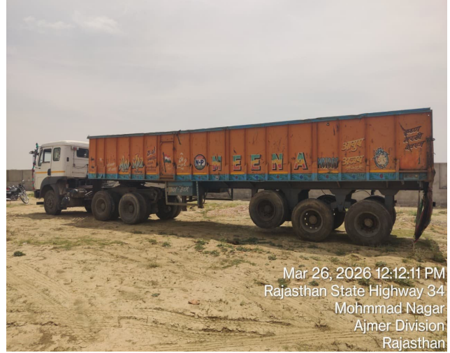
Mar 26, 2026 12:12:11 PM Rajasthan State Highway 34 Mohammad Nagar Ajmer Division Rajasthan