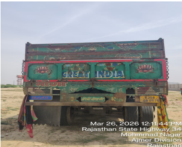
Mar 26, 2026 12:11:44 PM Rajasthan State Highway 34 Mohammad Nagar Ajmer Division Rajasthan