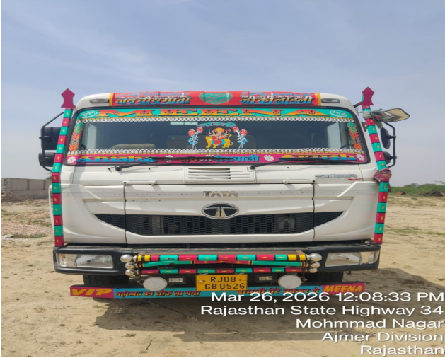
Mar 26, 2026 12:08:33 PM Rajasthan State Highway 34 Mohammad Nagar Ajmer Division Rajasthan

Surveyor & Loss Assessor (SLA / 65869 Valid up to 27-09-27)