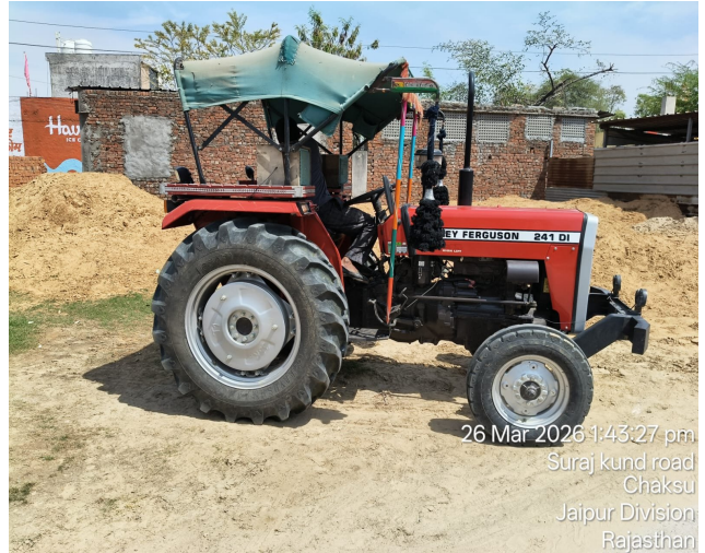
26 Mar 2026 1:43:27 pm Suraj kund road Chaksu Jaipur Division Rajasthan