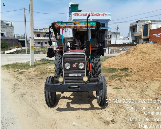
26 Mar 2026 1:43:08 pm Suraj kund road Chaksu Jaipur Division Rajasthan

Surveyor & Loss Assessor (SLA / 65869 Valid up to 27-09-27)