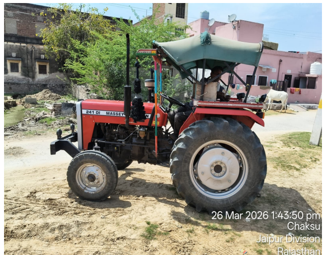
26 Mar 2026 1:43:50 pm Chaksu Jaipur Division Rajasthan