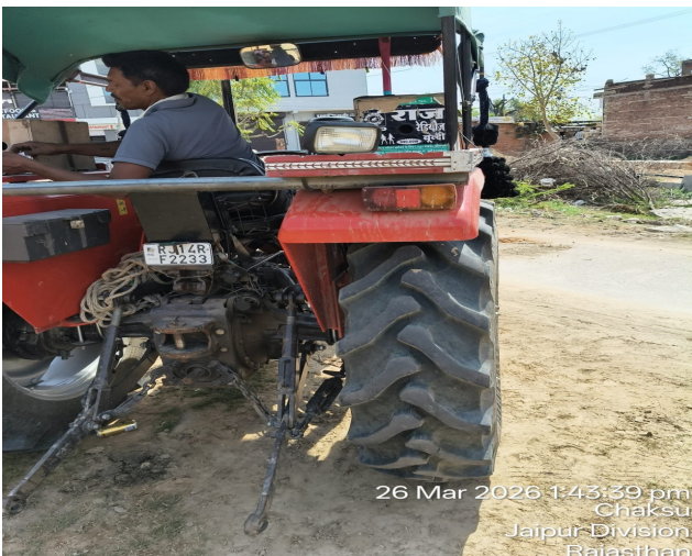
26 Mar 2026 1:43:39 pm Chaksu Jaipur Division Rajasthan