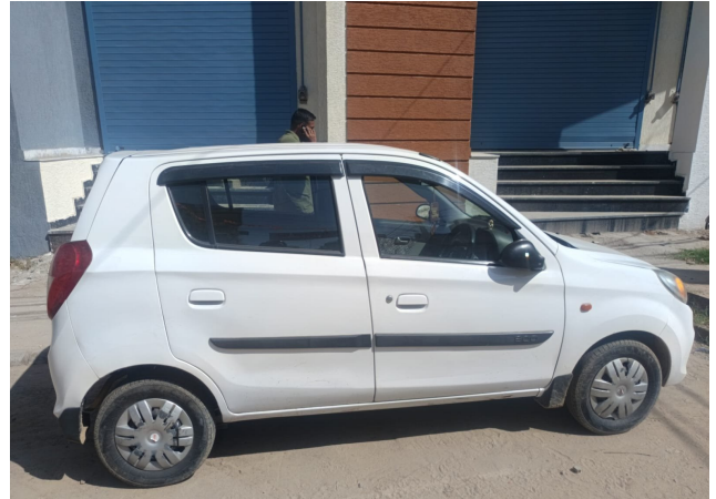
25 Mar 2026 10:14:00 211, Sriram Nagar, Jhotwara, Jaipur, Rajasthan 302012, India