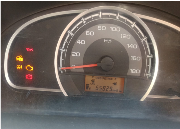
25 Mar 2026 10:14:47 211, Sriram Nagar, Jhotwara, Jaipur, Rajasthan 302012, India