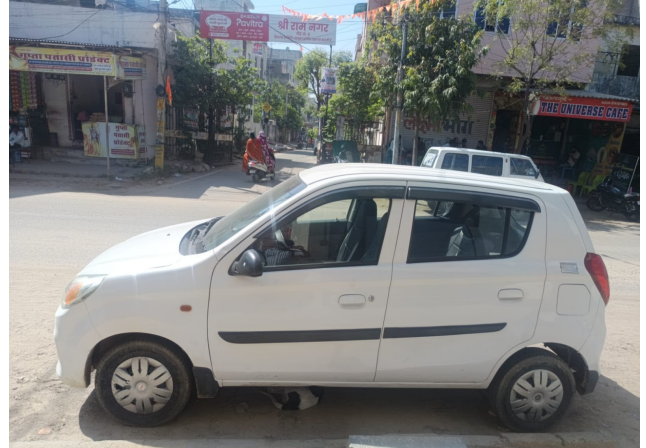
25 Mar 2026 10:13:42 211, Sriram Nagar, Jhotwara, Jaipur, Rajasthan 302012, India