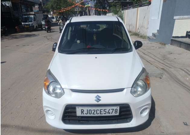
25 Mar 2026 10:13:28 Nagar, Sony Colony, Shyam Puri, Jhotwara, Jaipur, Rajasthan 302012, India

Surveyor & Loss Assessor (SLA / 65869 Valid up to 27-09-27)