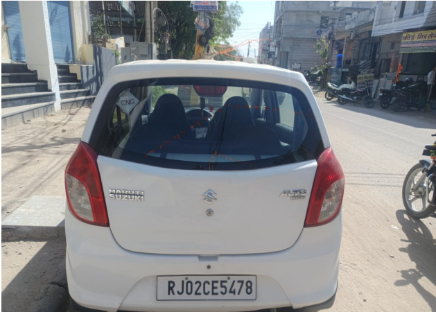
25 Mar 2026 10:13:51 211, Sriram Nagar, Jhotwara, Jaipur, Rajasthan 302012, India