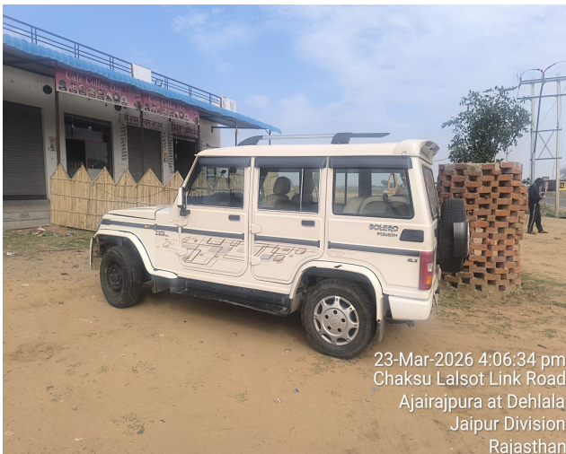
23-Mar-2026 4:06:34 pm Chaksu Lalsot Link Road Ajairajpura at Dehlala Jaipur Division Rajasthan