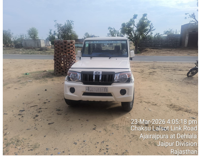
23-Mar-2026 4:05:18 pm Chaksu Lalsot Link Road Ajairajpura at Dehlala Jaipur Division Rajasthan