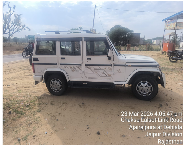
23-Mar-2026 4:05:47 pm Chaksu Lalsot Link Road Ajairajpura at Dehlala Jaipur Division Rajasthan