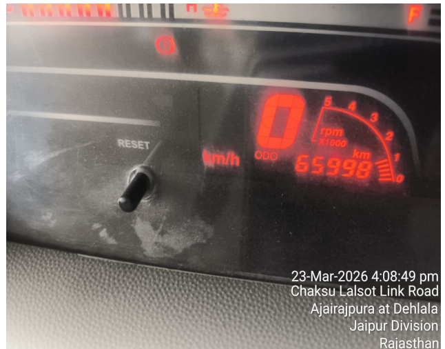
23-Mar-2026 4:08:49 pm Chaksu Lalsot Link Road Ajairajpura at Dehlala Jaipur Division Rajasthan