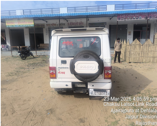
23-Mar-2026 4:05:59 pm Chaksu Lalsot Link Road Ajairajpura at Dehlala Jaipur Division Rajasthan