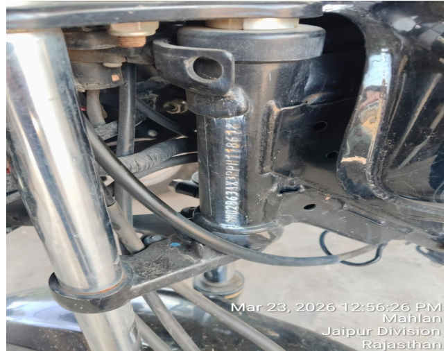
Mar 23, 2026 12:56:26 PM Mahlan Jaipur Division Rajasthan