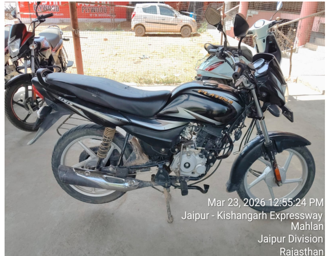
Mar 23, 2026 12:55:24 PM Jaipur - Kishangarh Expressway Mahlan Jaipur Division Rajasthan