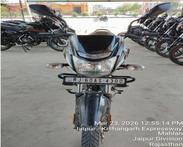
Mar 23, 2026 12:55:14 PM Jaipur - Kishangarh Expressway Mahlan Jaipur Division Rajasthan