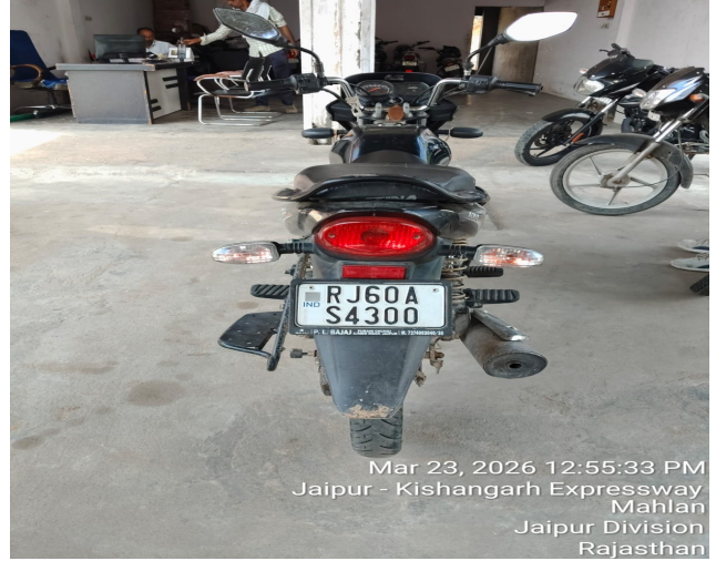
Mar 23, 2026 12:55:33 PM Jaipur - Kishangarh Expressway Mahlan Jaipur Division Rajasthan