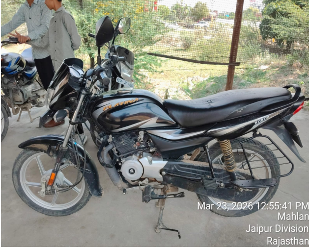
Mar 23, 2026 12:55:41 PM Mahlan Jaipur Division Rajasthan

Surveyor & Loss Assessor (SLA / 65869 Valid up to 27-09-27)