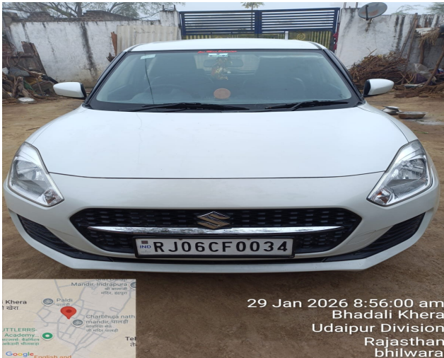
29 Jan 2026 8:56:00 am Bhadali Khera Udaipur Division Rajasthan bhilwara