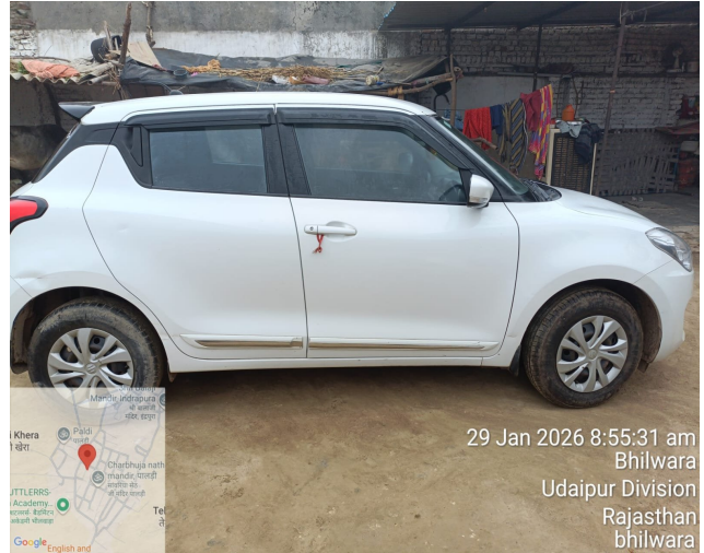
29 Jan 2026 8:55:31 am Bhilwara Udaipur Division Rajasthan bhilwara