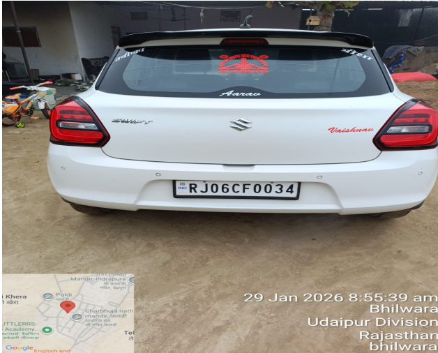
29 Jan 2026 8:55:39 am Bhilwara Udaipur Division Rajasthan bhilwara