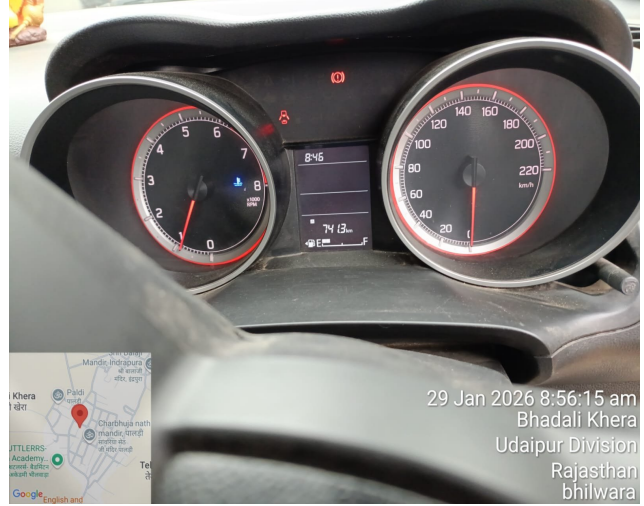
29 Jan 2026 8:56:15 am Bhadali Khera Udaipur Division Rajasthan bhilwara