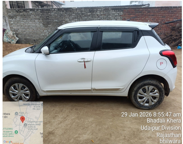
29 Jan 2026 8:55:47 am Bhadali Khera Udaipur Division Rajasthan bhilwara