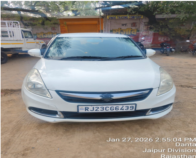
Jan 27, 2026 2:55:04 PM Danta Jaipur Division Rajasthan