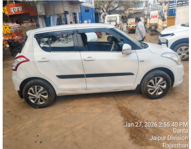
Jan 27, 2026 2:55:40 PM Danta Jaipur Division Rajasthan