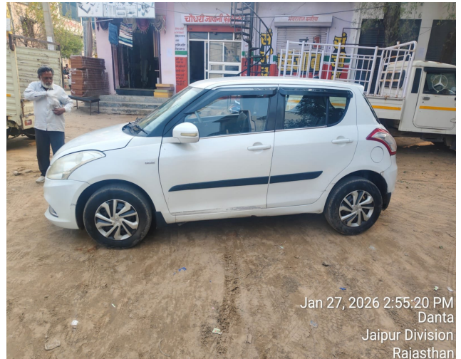
Jan 27, 2026 2:55:20 PM Danta Jaipur Division Rajasthan