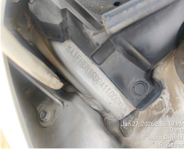
Jan 27, 2026 2:56:19 PM Danta Jaipur Division Rajasthan

Surveyor & Loss Assessor (SLA / 65869 Valid up to 27-09-27)