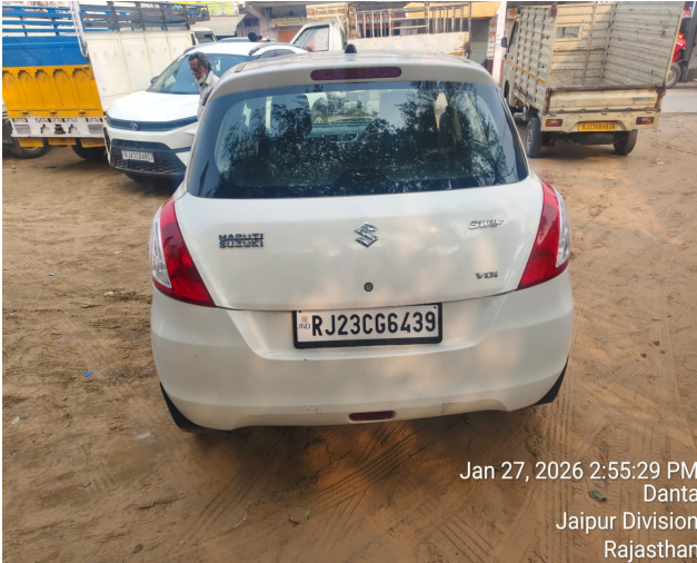
Jan 27, 2026 2:55:29 PM Danta Jaipur Division Rajasthan