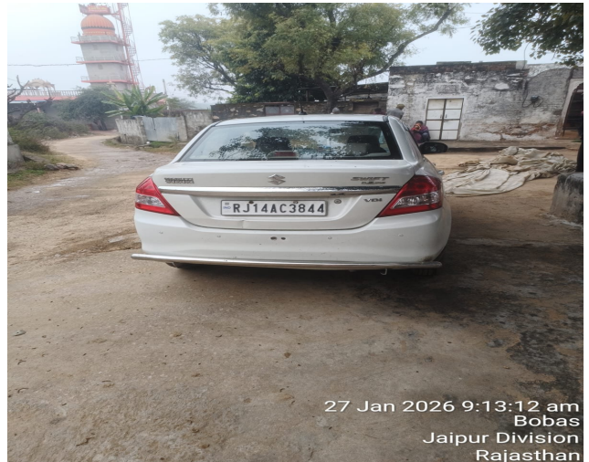
27 Jan 2026 9:13:12 am Bobas Jaipur Division Rajasthan