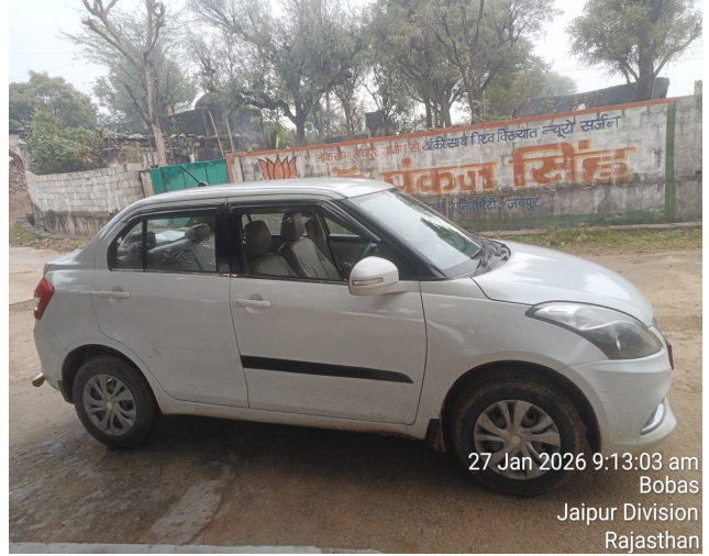
27 Jan 2026 9:13:03 am Bobas Jaipur Division Rajasthan