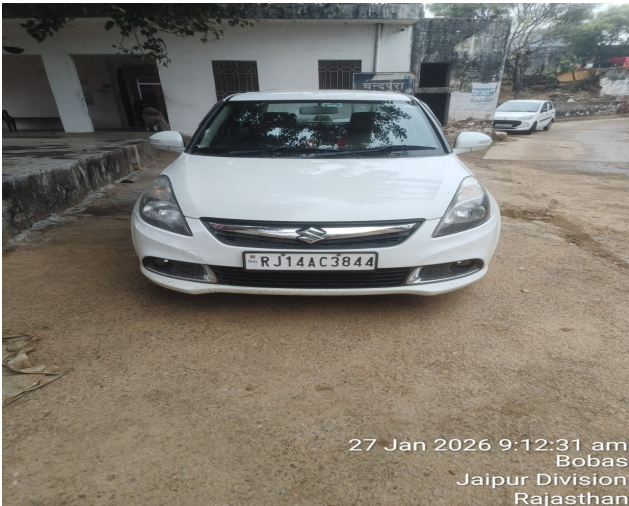
27 Jan 2026 9:12:31 am Bobas Jaipur Division Rajasthan