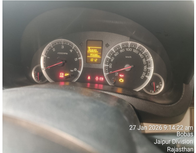
27 Jan 2026 9:14:22 am Bobas Jaipur Division Rajasthan