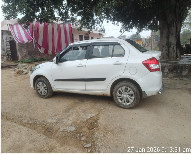
27 Jan 2026 9:13:31 am Bobas Jaipur Division Rajasthan

Surveyor & Loss Assessor (SLA / 65869 Valid up to 27-09-27)