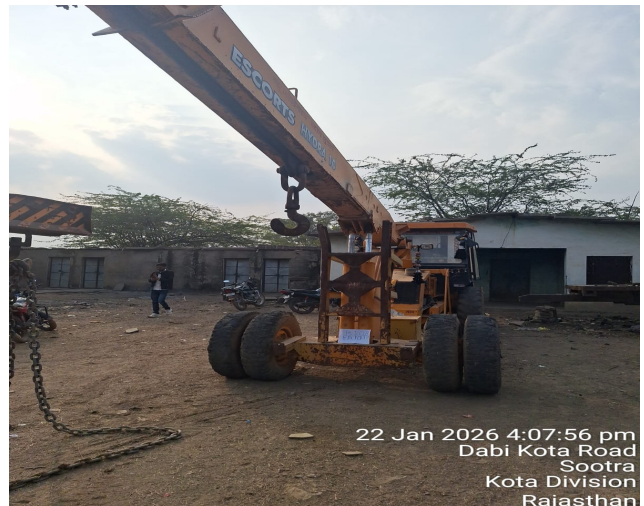
22 Jan 2026 4:07:56 pm Dabi Kota Road Sootra Kota Division Rajasthan