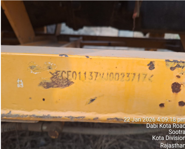
22 Jan 2026 4:09:18 pm Dabi Kota Road Sootra Kota Division Rajasthan

Surveyor & Loss Assessor (SLA / 65869 Valid up to 27-09-27)