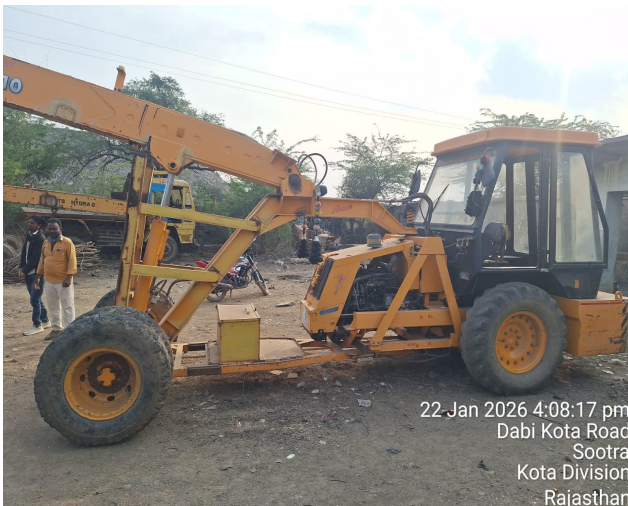
22 Jan 2026 4:08:17 pm Dabi Kota Road Sootra Kota Division Rajasthan