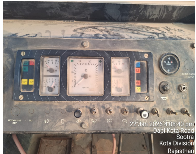
22 Jan 2026 4:08:40 pm Dabi Kota Road Sootra Kota Division Rajasthan