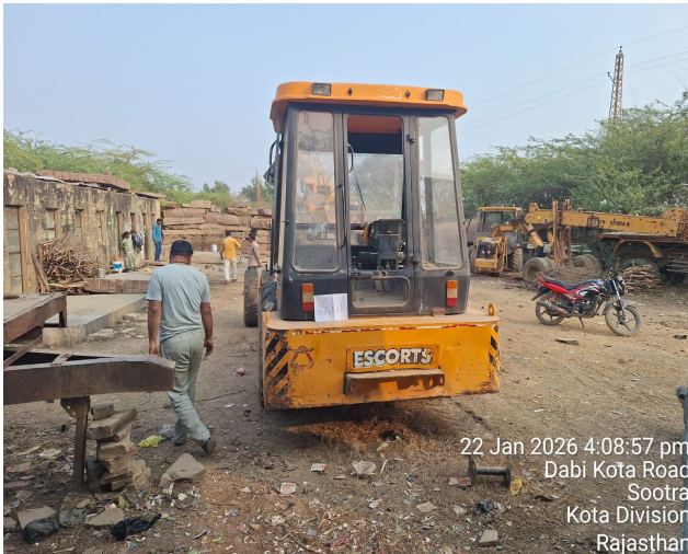
22 Jan 2026 4:08:57 pm Dabi Kota Road Sootra Kota Division Rajasthan