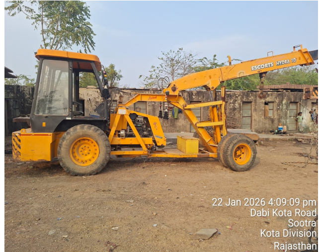
22 Jan 2026 4:09:09 pm Dabi Kota Road Sootra Kota Division Rajasthan