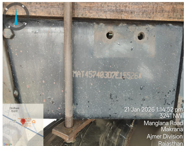
21 Jan 2026 1:14:52 pm 324° NW Manglana Road Makrana Ajmer Division Rajasthan