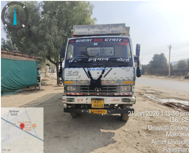
21 Jan 2026 1:13:36 pm 136° SE Deawali Colony Makrana Ajmer Division Rajasthan