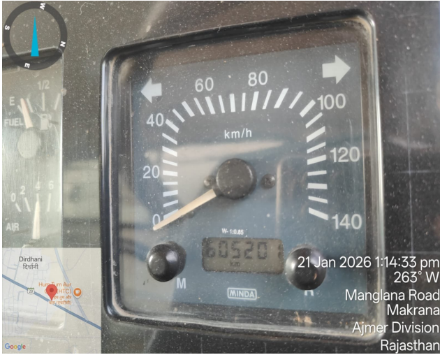
21 Jan 2026 1:14:33 pm 263° W Manglana Road Makrana Ajmer Division Rajasthan

Surveyor & Loss Assessor (SLA / 65869 Valid up to 27-09-27)