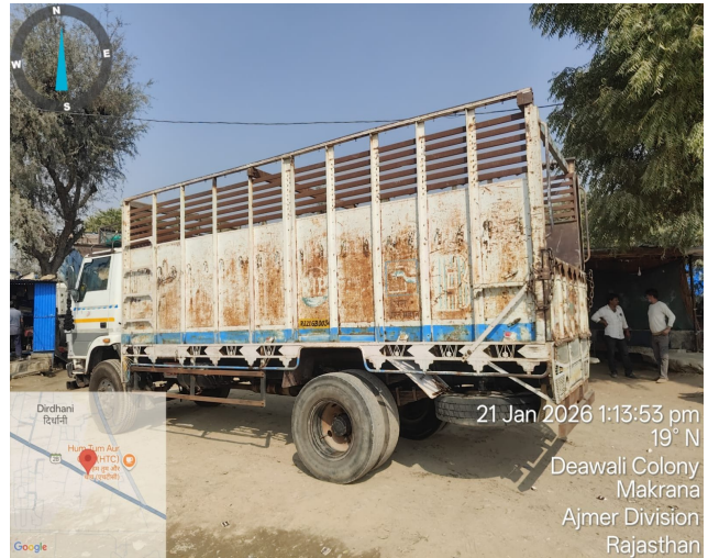
21 Jan 2026 1:13:53 pm 19° N Deawali Colony Makrana Ajmer Division Rajasthan