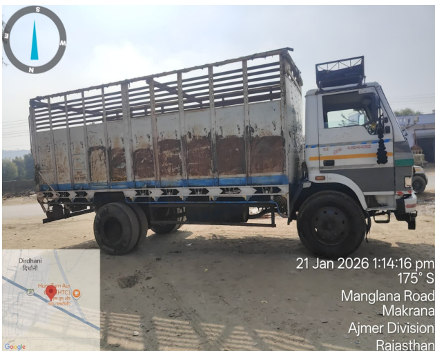
21 Jan 2026 1:14:16 pm 175° S Manglana Road Makrana Ajmer Division Rajasthan