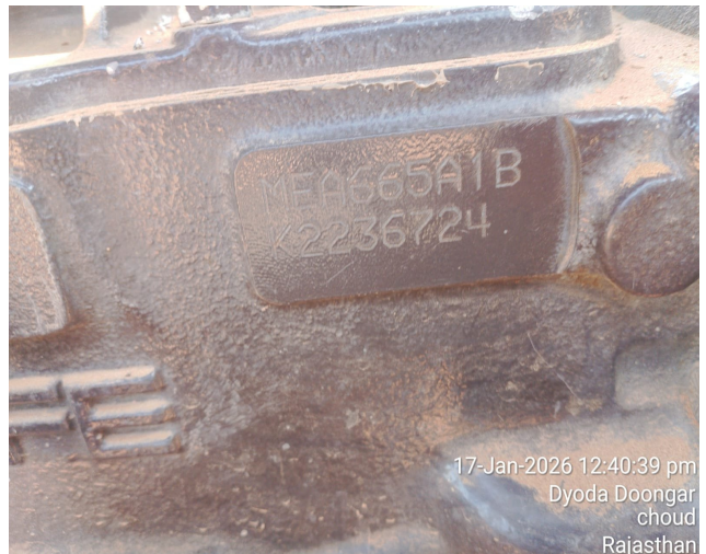
17-Jan-2026 12:40:39 pm Dyoda Doongar choud Rajasthan