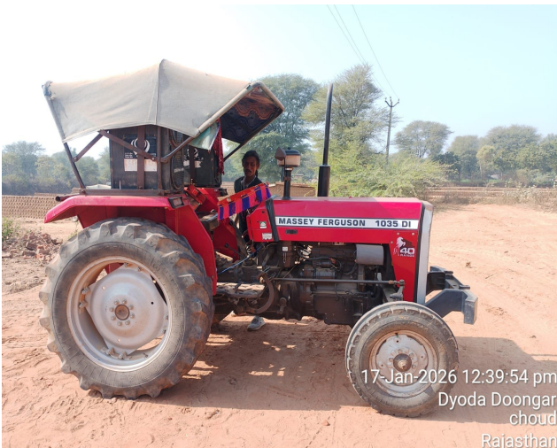
17-Jan-2026 12:39:54 pm Dyoda Doongar choud Rajasthan