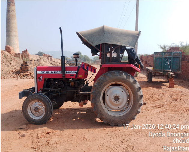
17-Jan-2026 12:40:24 pm Dyoda Doongar choud Rajasthan