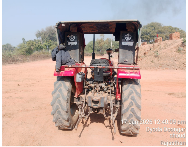
17-Jan-2026 12:40:09 pm Dyoda Doongar choud Rajasthan