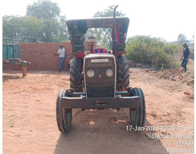
17-Jan-2026 12:39:41 pm Dyoda Doongar choud Rajasthan