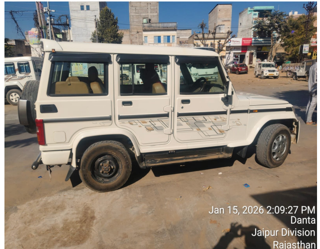
Jan 15, 2026 2:09:27 PM Danta Jaipur Division Rajasthan