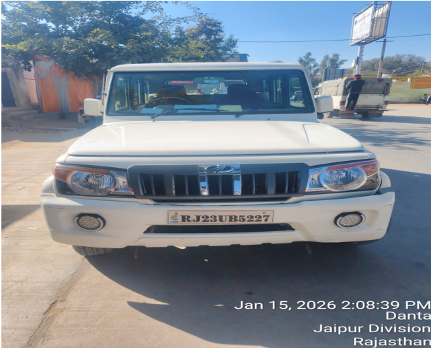
Jan 15, 2026 2:08:39 PM Danta Jaipur Division Rajasthan