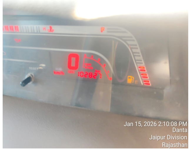
Jan 15, 2026 2:10:08 PM Danta Jaipur Division Rajasthan