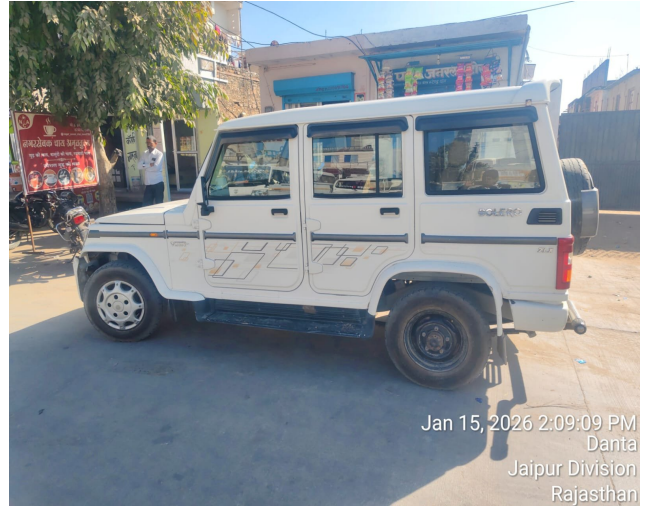
Jan 15, 2026 2:09:09 PM Danta Jaipur Division Rajasthan