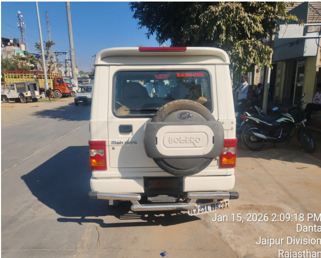
Jan 15, 2026 2:09:18 PM Danta Jaipur Division Rajasthan