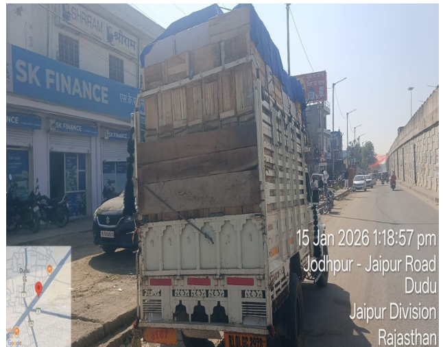
15 Jan 2026 1:18:57 pm Jodhpur - Jaipur Road Dudu Jaipur Division Rajasthan