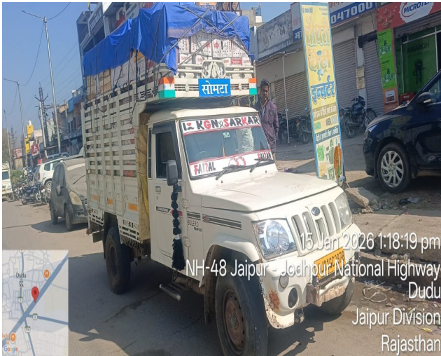
15 Jan 2026 1:18:19 pm NH-48 Jaipur - Jodhpur National Highway Dudu Jaipur Division Rajasthan