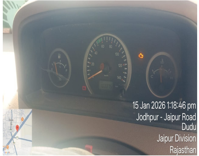
15 Jan 2026 1:18:46 pm Jodhpur - Jaipur Road Dudu Jaipur Division Rajasthan