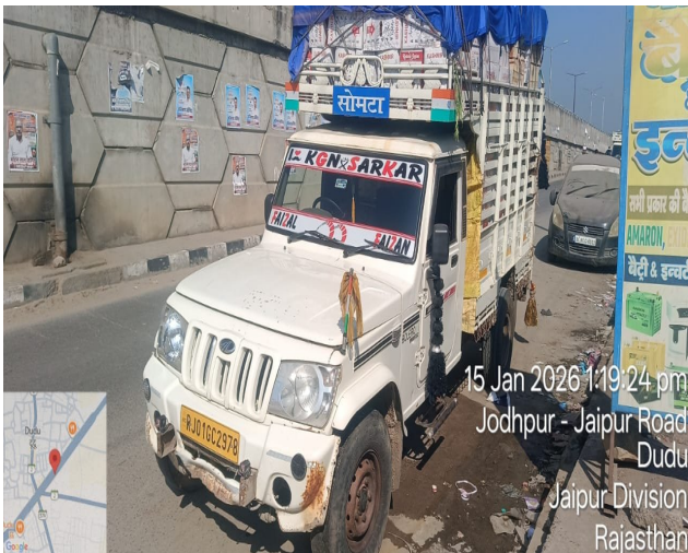
15 Jan 2026 1:19:24 pm Jodhpur - Jaipur Road Dudu Jaipur Division Rajasthan