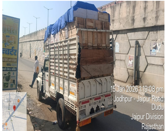
15 Jan 2026 1:19:08 pm Jodhpur - Jaipur Road Dudu Jaipur Division Rajasthan