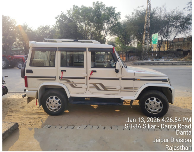
Jan 13, 2026 4:26:54 PM SH-8A Sikar - Danta Road Danta Jaipur Division Rajasthan