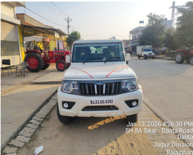
Jan 13, 2026 4:26:30 PM SH-8A Sikar - Danta Road Danta Jaipur Division Rajasthan