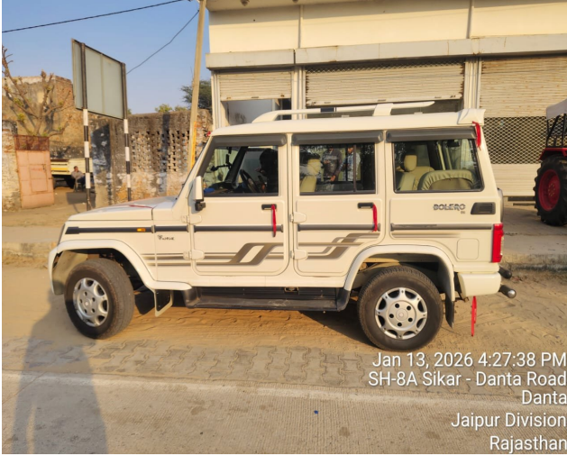
Jan 13, 2026 4:27:38 PM SH-8A Sikar - Danta Road Danta Jaipur Division Rajasthan

Surveyor & Loss Assessor (SLA / 65869 Valid up to 27-09-27)