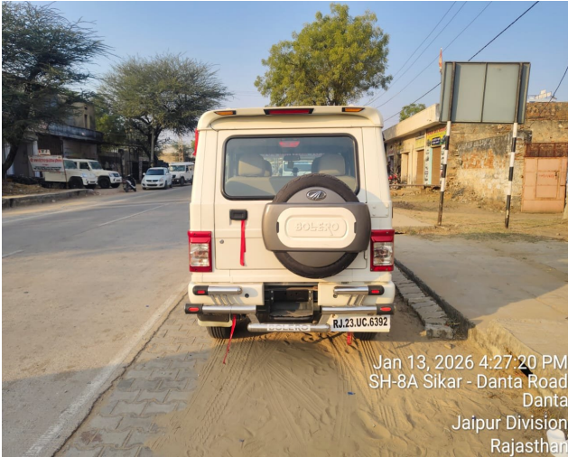
Jan 13, 2026 4:27:20 PM SH-8A Sikar - Danta Road Danta Jaipur Division Rajasthan