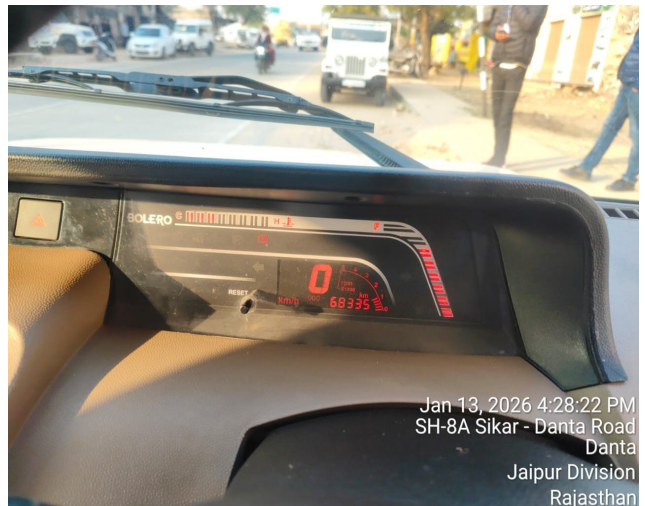
Jan 13, 2026 4:28:22 PM SH-8A Sikar - Danta Road Danta Jaipur Division Rajasthan