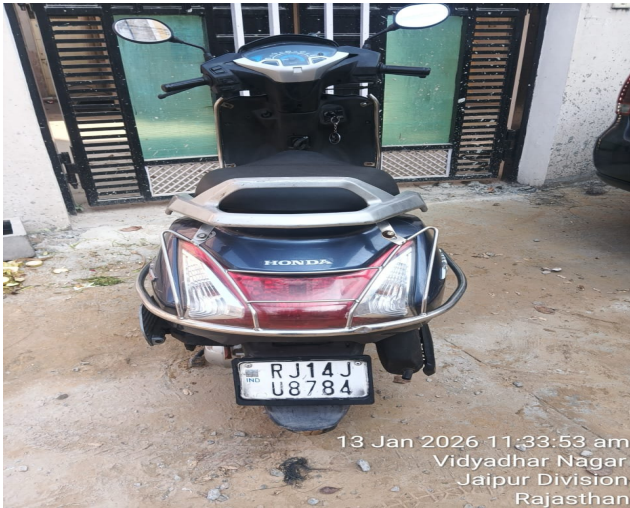
13 Jan 2026 11:33:53 am Vidyadhar Nagar Jaipur Division Rajasthan