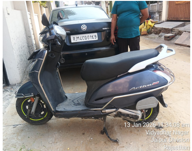
13 Jan 2026 11:34:08 am Vidyadhar Nagar Jaipur Division Rajasthan