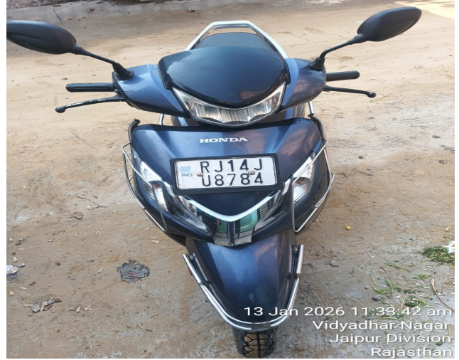
13 Jan 2026 11:38:42 am Vidyadhar Nagar Jaipur Division Rajasthan