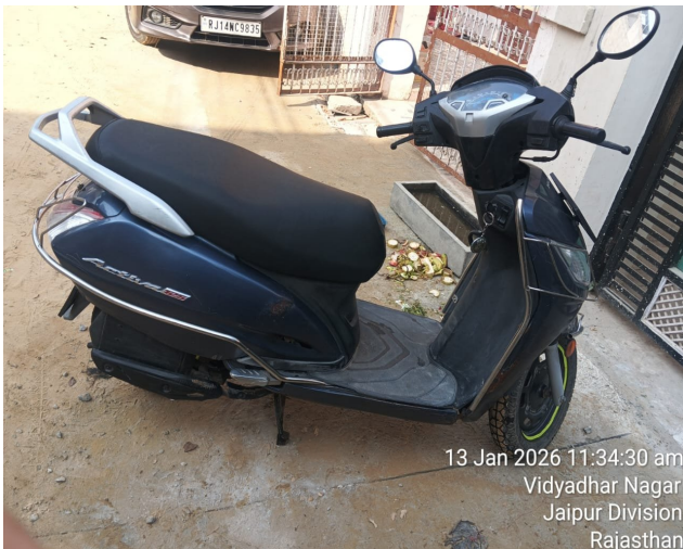
13 Jan 2026 11:34:30 am Vidyadhar Nagar Jaipur Division Rajasthan