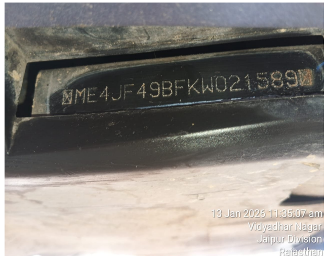
13 Jan 2026 11:35:07 am Vidyadhar Nagar Jaipur Division Rajasthan