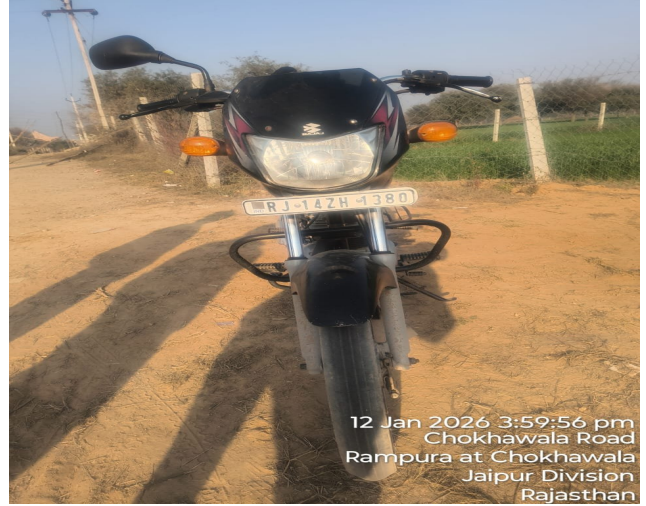
12 Jan 2026 3:59:56 pm Chokhawala Road Rampura at Chokhawala Jaipur Division Rajasthan