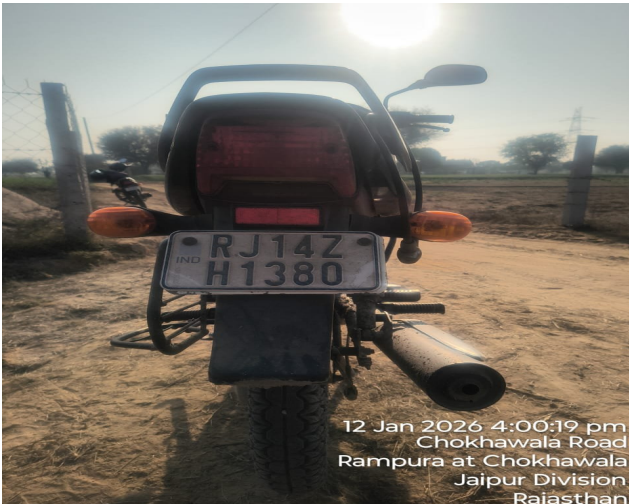
12 Jan 2026 4:00:19 pm Chokhawala Road Rampura at Chokhawala Jaipur Division Rajasthan