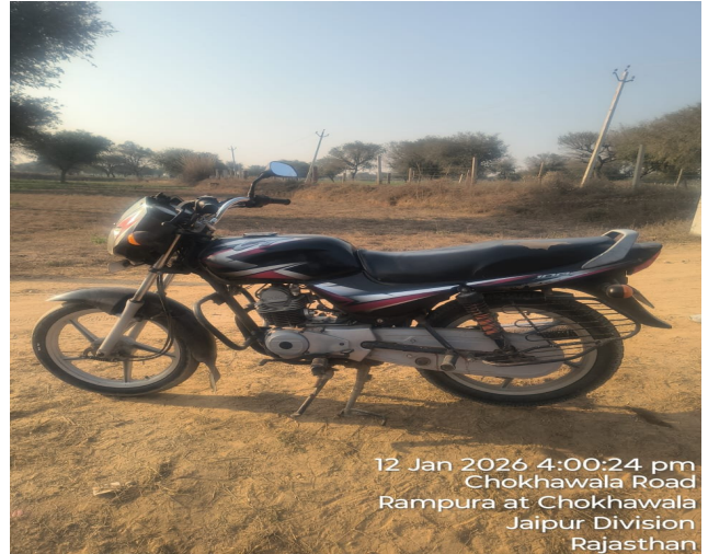
12 Jan 2026 4:00:24 pm Chokhawala Road Rampura at Chokhawala Jaipur Division Rajasthan