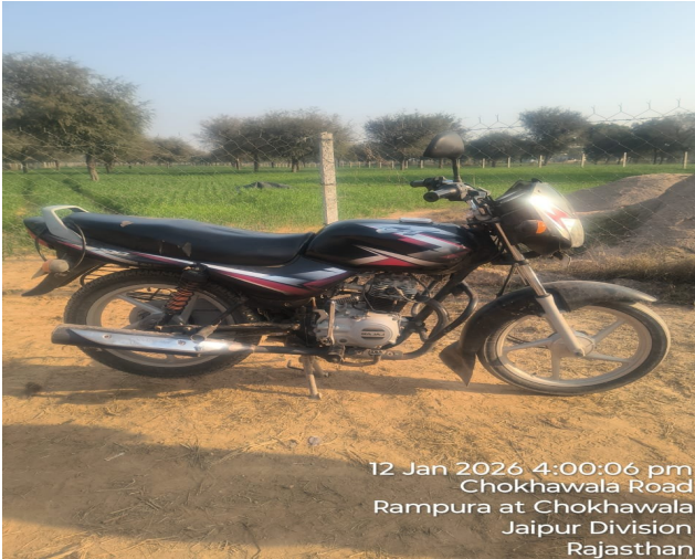
12 Jan 2026 4:00:06 pm Chokhawala Road Rampura at Chokhawala Jaipur Division Rajasthan