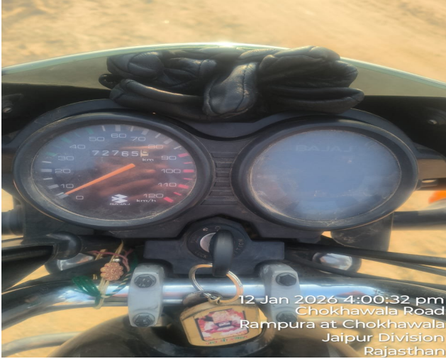
12 Jan 2026 4:00:32 pm Chokhawala Road Rampura at Chokhawala Jaipur Division Rajasthan

Surveyor & Loss Assessor (SLA / 65869 Valid up to 27-09-27)