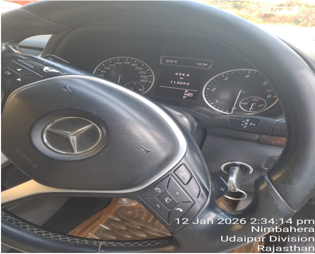
12 Jan 2026 2:34:14 pm Nimbahera Udaipur Division Rajasthan

Surveyor & Loss Assessor (SLA / 65869 Valid up to 27-09-27)