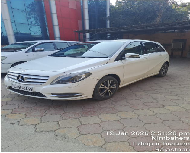
12 Jan 2026 2:51:28 pm Nimbahera Udaipur Division Rajasthan