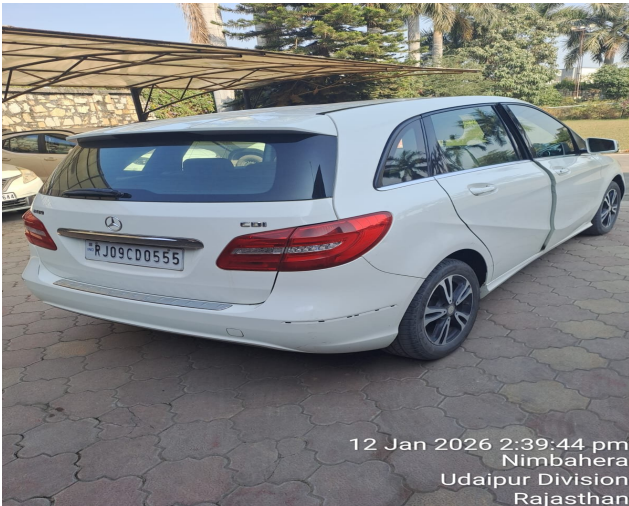
12 Jan 2026 2:39:44 pm Nimbahera Udaipur Division Rajasthan