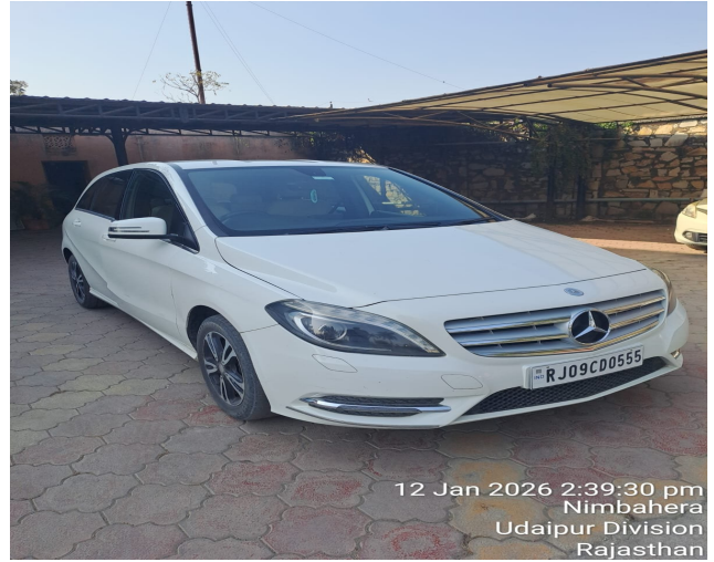
12 Jan 2026 2:39:30 pm Nimbahera Udaipur Division Rajasthan