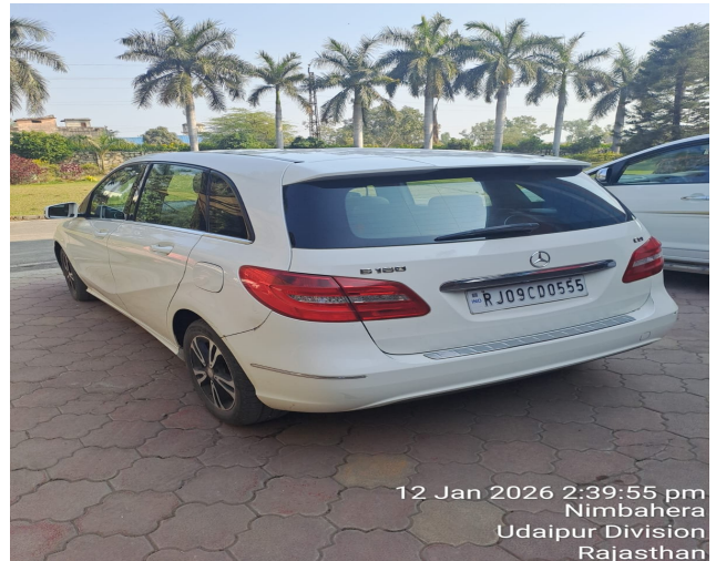
12 Jan 2026 2:39:55 pm Nimbahera Udaipur Division Rajasthan