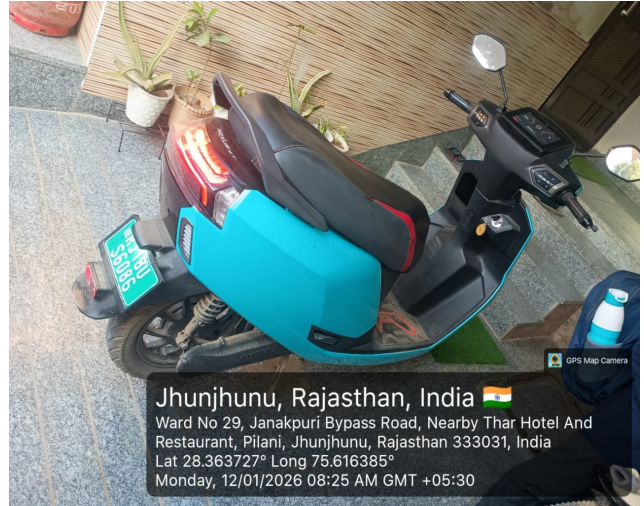
Jhunjhunu, Rajasthan, India Ward No 29, Janakpuri Bypass Road, Nearby Thar Hotel And Restaurant, Pilani, Jhunjhunu, Rajasthan 333031, India Lat 28.363727° Long 75.616385° Monday, 12/01/2026 08:25 AM GMT +05:30