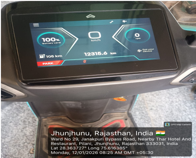
Jhunjhunu, Rajasthan, India Ward No 29, Janakpuri Bypass Road, Nearby Thar Hotel And Restaurant, Pilani, Jhunjhunu, Rajasthan 333031, India Lat 28.363727° Long 75.616385° Monday, 12/01/2026 08:25 AM GMT +05:30