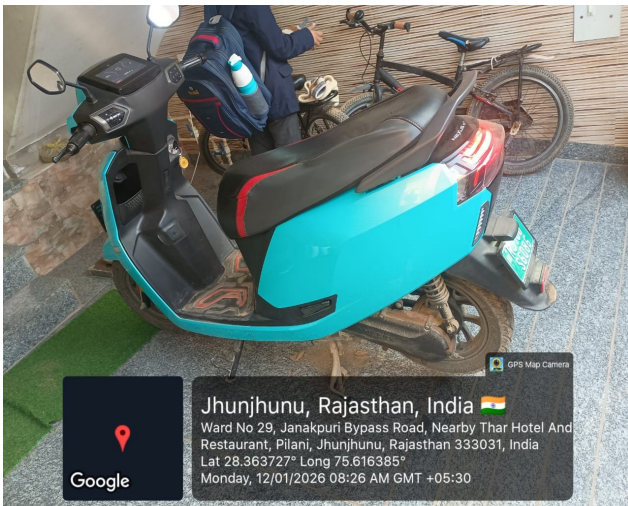
Jhunjhunu, Rajasthan, India Ward No 29, Janakpuri Bypass Road, Nearby Thar Hotel And Restaurant, Pilani, Jhunjhunu, Rajasthan 333031, India Lat 28.363727° Long 75.616385° Monday, 12/01/2026 08:26 AM GMT +05:30