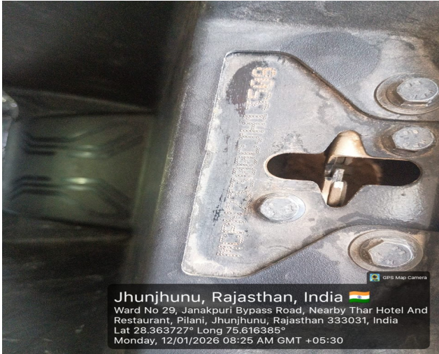
Jhunjhunu, Rajasthan, India Ward No 29, Janakpuri Bypass Road, Nearby Thar Hotel And Restaurant, Pilani, Jhunjhunu, Rajasthan 333031, India Lat 28.363727° Long 75.616385° Monday, 12/01/2026 08:25 AM GMT +05:30

Surveyor & Loss Assessor (SLA / 65869 Valid up to 27-09-27)