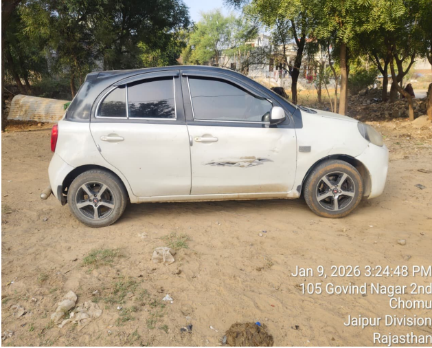
Jan 9, 2026 3:24:48 PM 105 Govind Nagar 2nd Chomu Jaipur Division Rajasthan

Surveyor & Loss Assessor (SLA / 65869 Valid up to 27-09-27)