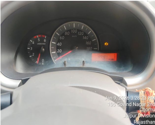
Jan 9, 2026 3:28:23 PM 105 Govind Nagar 2nd Chomu Jaipur Division Rajasthan