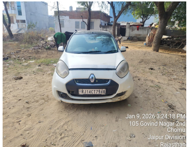
Jan 9, 2026 3:24:18 PM 105 Govind Nagar 2nd Chomu Jaipur Division Rajasthan