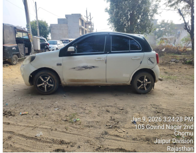
Jan 9, 2026 3:24:28 PM 105 Govind Nagar 2nd Chomu Jaipur Division Rajasthan