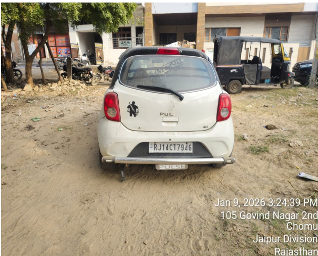
Jan 9, 2026 3:24:39 PM 105 Govind Nagar 2nd Chomu Jaipur Division Rajasthan