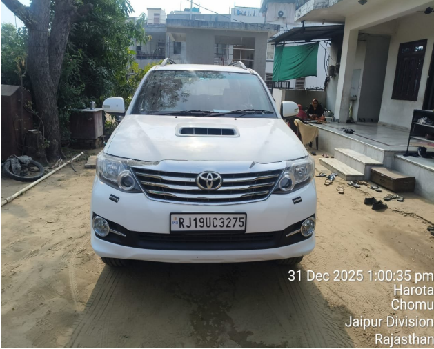
31 Dec 2025 1:00:35 pm Harota Chomu Jaipur Division Rajasthan

Surveyor & Loss Assessor (SLA / 65869 Valid up to 27-09-27)