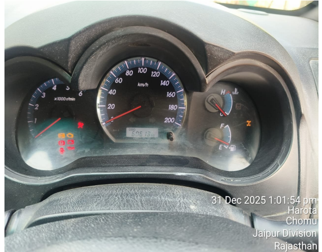
31 Dec 2025 1:01:54 pm Harota Chomu Jaipur Division Rajasthan