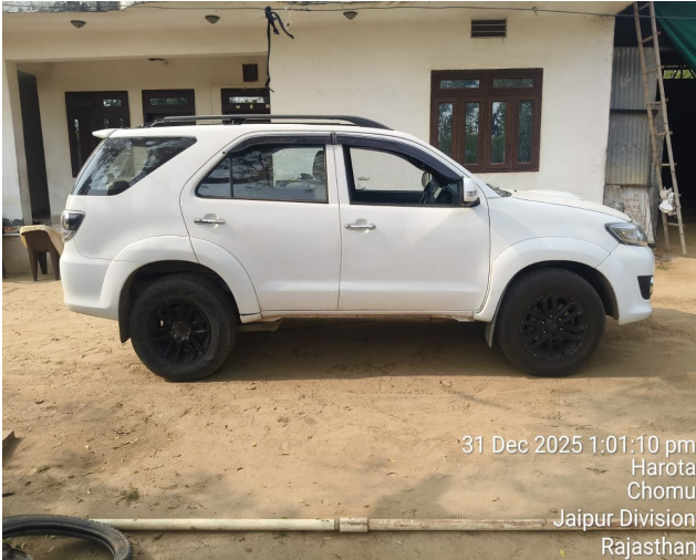
31 Dec 2025 1:01:10 pm Harota Chomu Jaipur Division Rajasthan