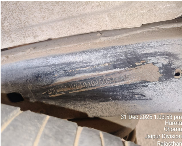
31 Dec 2025 1:03:53 pm Harota Chomu Jaipur Division Rajasthan