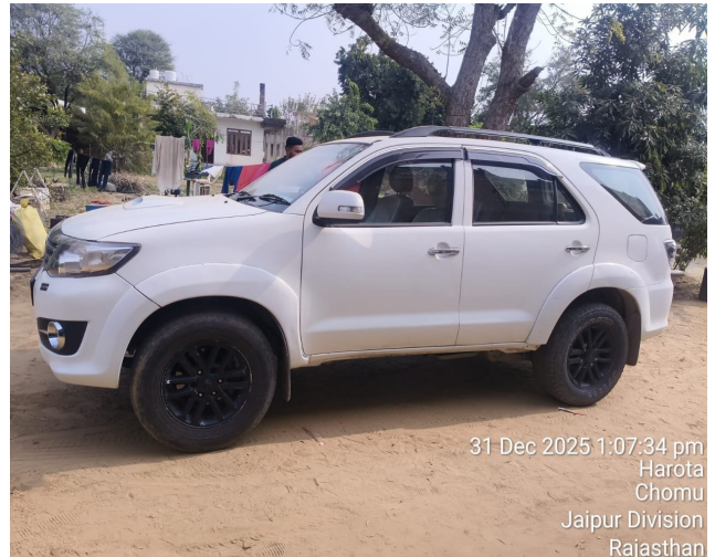
31 Dec 2025 1:07:34 pm Harota Chomu Jaipur Division Rajasthan