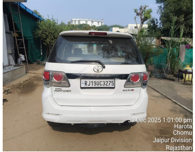
31 Dec 2025 1:01:00 pm Harota Chomu Jaipur Division Rajasthan