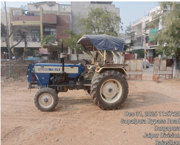
Dec 31, 2025 11:57:20 Gopalpura Bypass Road Durgapura Jaipur Division Rajasthan