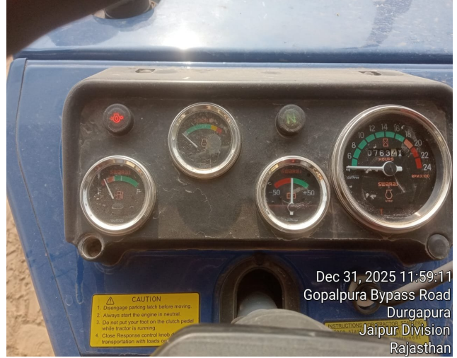
Dec 31, 2025 11:59:11 Gopalpura Bypass Road Durgapura Jaipur Division Rajasthan