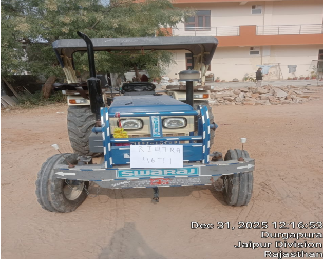
Dec 31, 2025 12:16:53 Durgapura Jaipur Division Rajasthan

Surveyor & Loss Assessor (SLA / 65869 Valid up to 27-09-27)