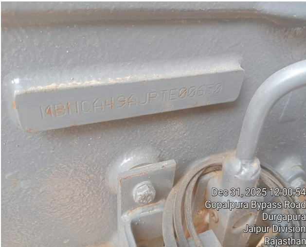
Dec 31, 2025 12:00:54 Gopalpura Bypass Road Durgapura Jaipur Division Rajasthan