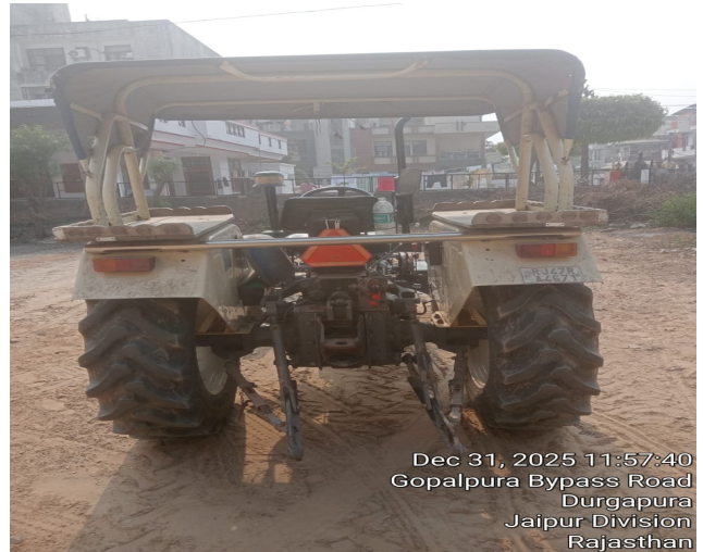
Dec 31, 2025 11:57:40 Gopalpura Bypass Road Durgapura Jaipur Division Rajasthan