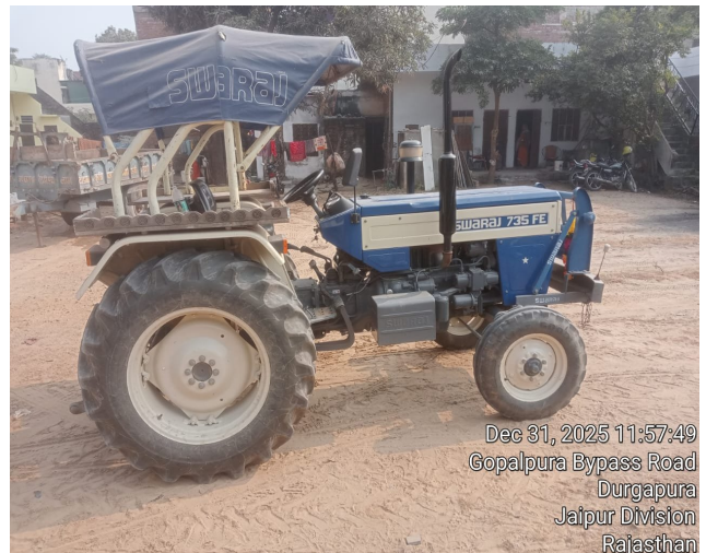
Dec 31, 2025 11:57:49 Gopalpura Bypass Road Durgapura Jaipur Division Rajasthan