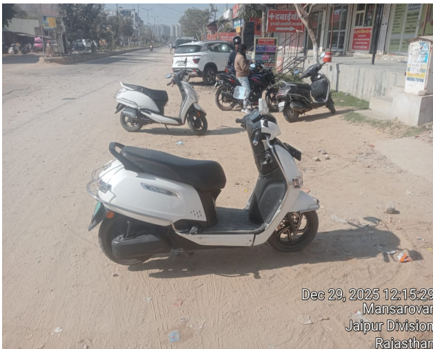
Dec 29, 2025 12:15:29 Mansarovar Jaipur Division Rajasthan