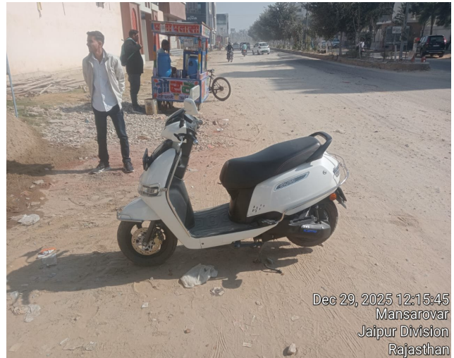
Dec 29, 2025 12:15:45 Mansarovar Jaipur Division Rajasthan