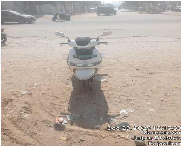
Dec 29, 2025 12:15:38 Mansarovar Jaipur Division Rajasthan