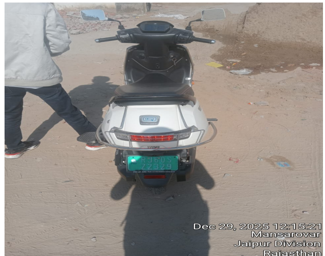
Dec 29, 2025 12:15:21 Mansarovar Jaipur Division Rajasthan