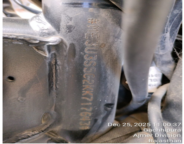
Dec 25, 2025 11:00:37 Gachhipura Ajmer Division Rajasthan