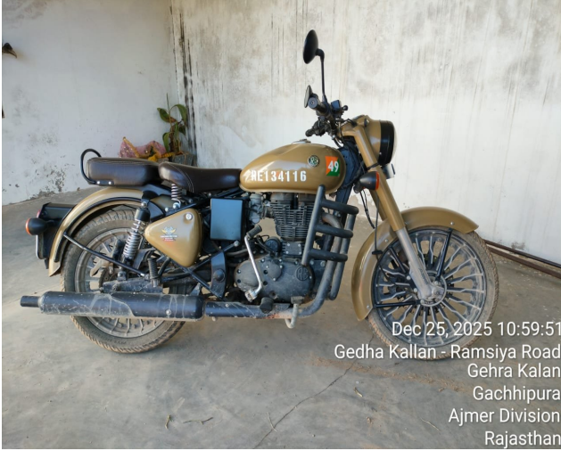
Dec 25, 2025 10:59:51 Gedha Kallan - Ramsiya Road Gehra Kalan Gachhipura Ajmer Division Rajasthan

Surveyor & Loss Assessor (SLA / 65869 Valid up to 27-09-27)