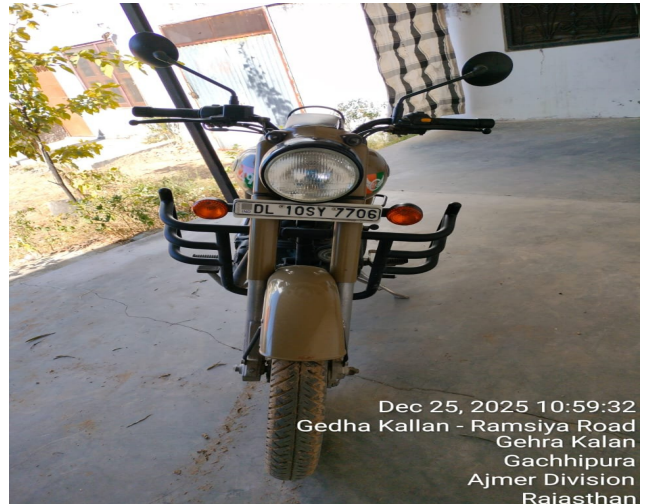
Dec 25, 2025 10:59:32 Gedha Kallan - Ramsiya Road Gehra Kalan Gachhipura Ajmer Division Rajasthan