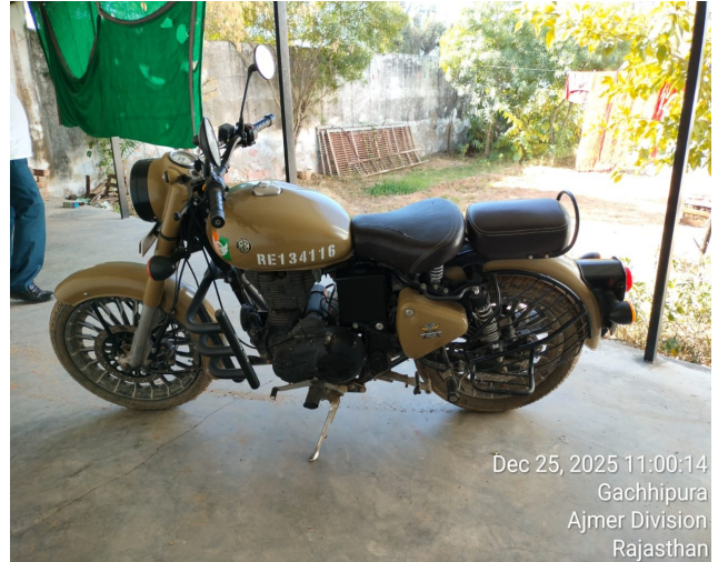
Dec 25, 2025 11:00:14 Gachhipura Ajmer Division Rajasthan