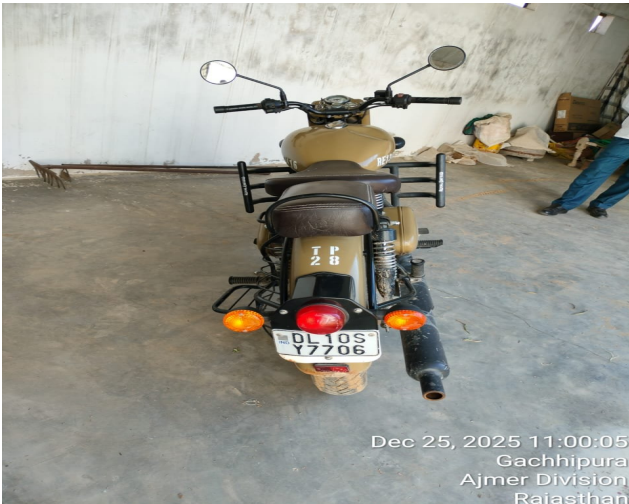
Dec 25, 2025 11:00:05 Gachhipura Ajmer Division Rajasthan