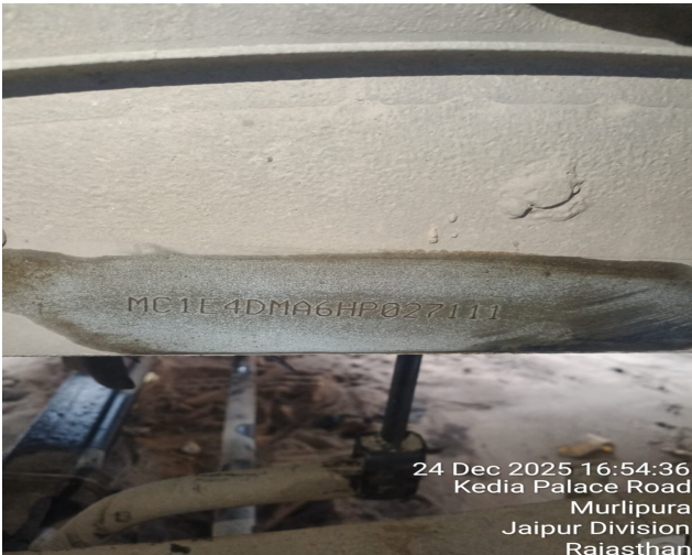
24 Dec 2025 16:54:36 Kedia Palace Road Murlipura Jaipur Division Rajasthan