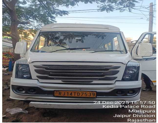
24 Dec 2025 16:57:50 Kedia Palace Road Murlipura Jaipur Division Rajasthan