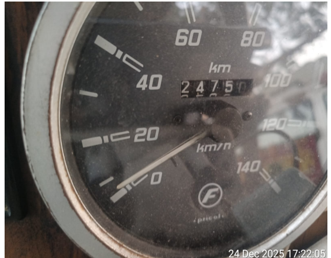
24 Dec 2025 17:22:05