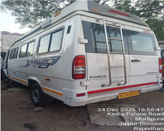
24 Dec 2025 16:55:47 Kedia Palace Road Murlipura Jaipur Division Rajasthan