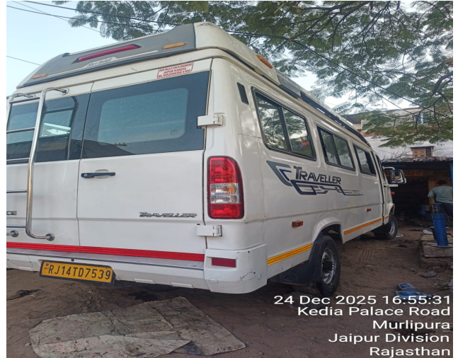
24 Dec 2025 16:55:31 Kedia Palace Road Murlipura Jaipur Division Rajasthan