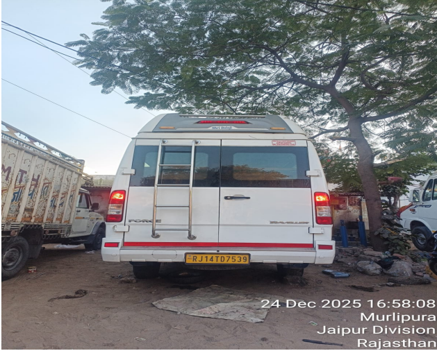
24 Dec 2025 16:58:08 Murlipura Jaipur Division Rajasthan

Surveyor & Loss Assessor (SLA / 65869 Valid up to 27-09-27)