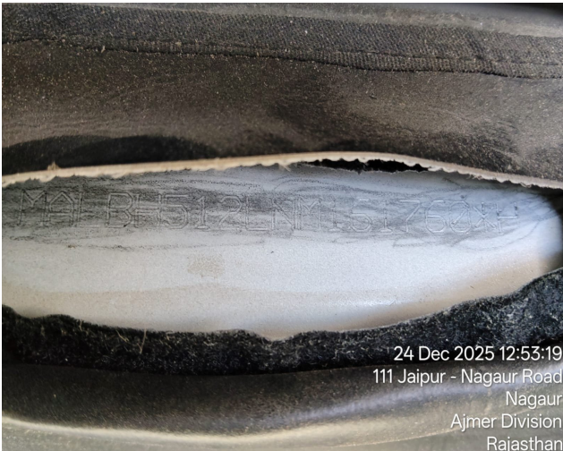
24 Dec 2025 12:53:19 111 Jaipur - Nagaur Road Nagaur Ajmer Division Rajasthan