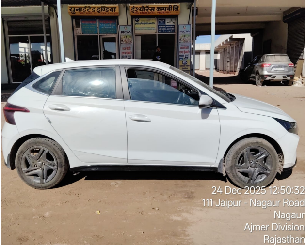
24 Dec 2025 12:50:32 111 Jaipur - Nagaur Road Nagaur Ajmer Division Rajasthan