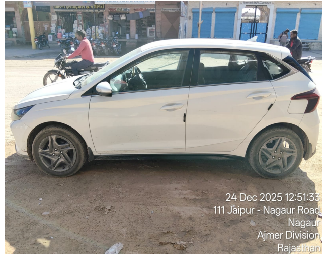
24 Dec 2025 12:51:33 111 Jaipur - Nagaur Road Nagaur Ajmer Division Rajasthan