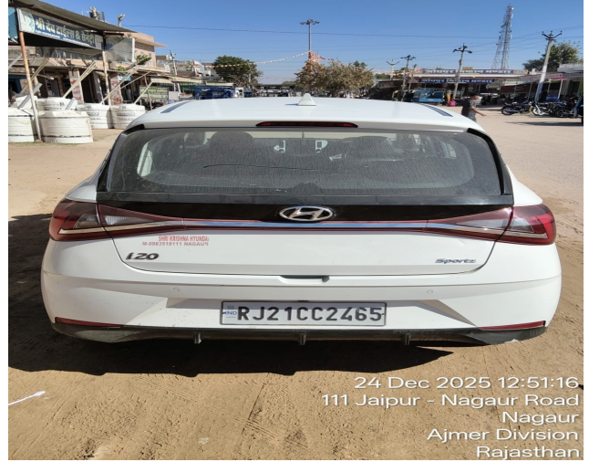
24 Dec 2025 12:51:16 111 Jaipur - Nagaur Road Nagaur Ajmer Division Rajasthan