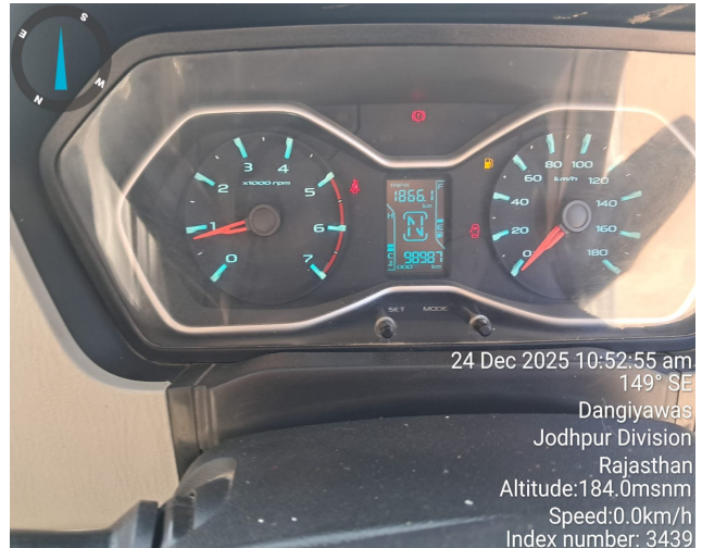
24 Dec 2025 10:52:55 am 149° SE Dangiyawas Jodhpur Division Rajasthan Altitude:184.0msnm Speed:0.0km/h Index number: 3439