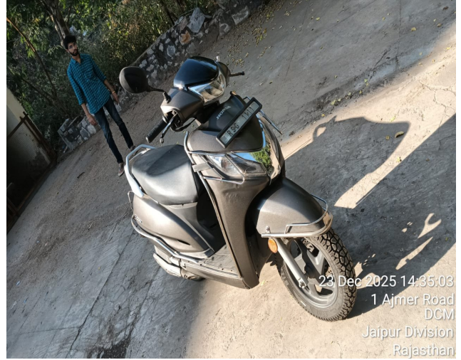
23 Dec 2025 14:35:03 1 Ajmer Road DCM Jaipur Division Rajasthan