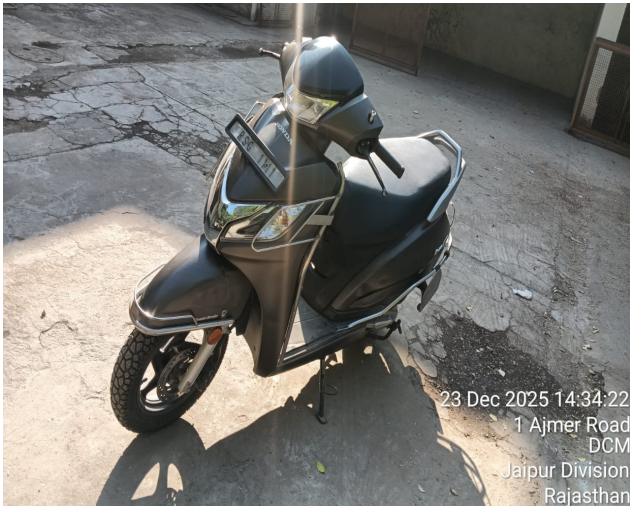
23 Dec 2025 14:34:22 1 Ajmer Road DCM Jaipur Division Rajasthan