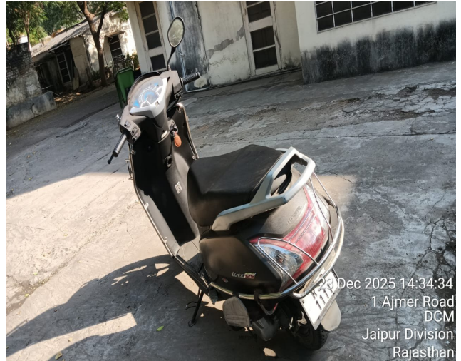
23 Dec 2025 14:34:34 1 Ajmer Road DCM Jaipur Division Rajasthan