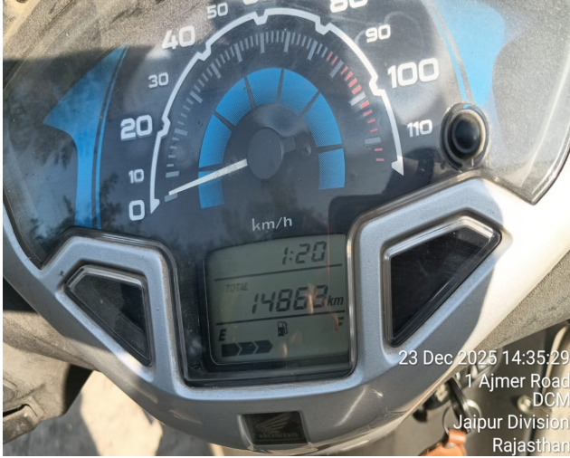
23 Dec 2025 14:35:29 1 Ajmer Road DCM Jaipur Division Rajasthan

Surveyor & Loss Assessor (SLA / 65869 Valid up to 27-09-27)