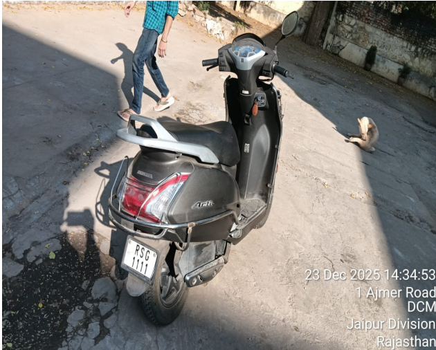
23 Dec 2025 14:34:53 1 Ajmer Road DCM Jaipur Division Rajasthan