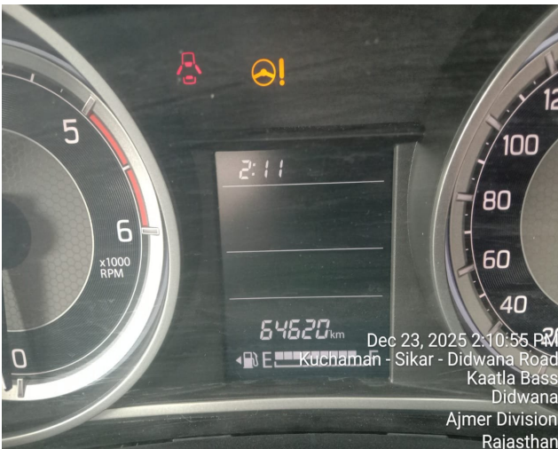
Dec 23, 2025 2:10:55 PM Kuchaman - Sikar - Didwana Road Kaatla Bass Didwana Ajmer Division Rajasthan