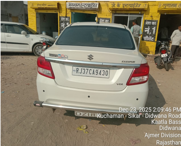
Dec 23, 2025 2:09:46 PM Kuchaman - Sikar - Didwana Road Kaatla Bass Didwana Ajmer Division Rajasthan