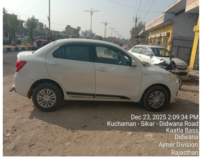
Dec 23, 2025 2:09:34 PM Kuchaman - Sikar - Didwana Road Kaatla Bass Didwana Ajmer Division Rajasthan