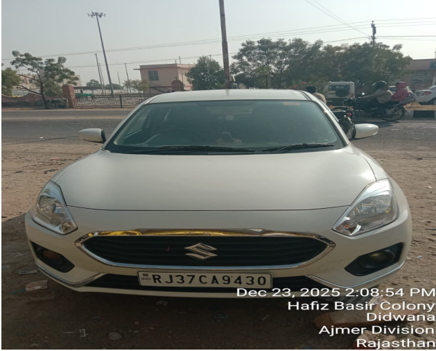
Dec 23, 2025 2:08:54 PM Hafiz Basir Colony Didwana Ajmer Division Rajasthan

Surveyor & Loss Assessor (SLA / 65869 Valid up to 27-09-27)