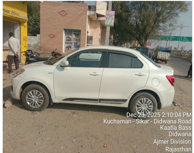
Dec 23, 2025 2:10:04 PM Kuchaman - Sikar - Didwana Road Kaatla Bass Didwana Ajmer Division Rajasthan