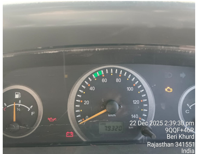
22 Dec 2025 2:39:30 pm 9QQF+46R Beri Khurd Rajasthan 341551 India