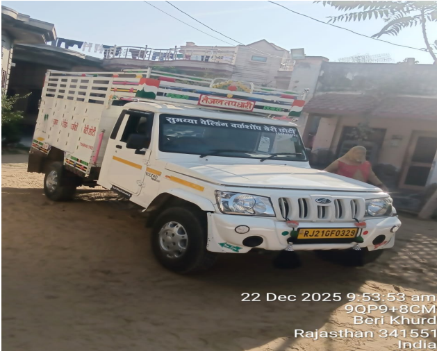
22 Dec 2025 9:53:53 am 9QP9+8CM Beri Khurd Rajasthan 341551 India