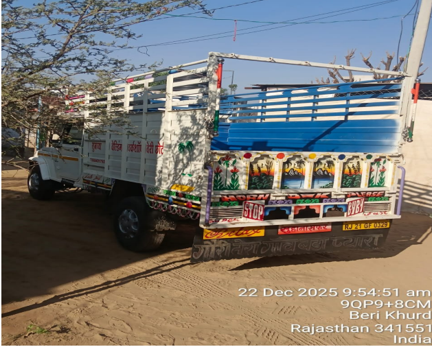
22 Dec 2025 9:54:51 am 9QP9+8CM Beri Khurd Rajasthan 341551 India

Surveyor & Loss Assessor (SLA / 65869 Valid up to 27-09-27)