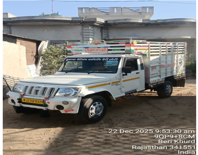
22 Dec 2025 9:53:30 am 9QP9+8CM Beri Khurd Rajasthan 341551 India