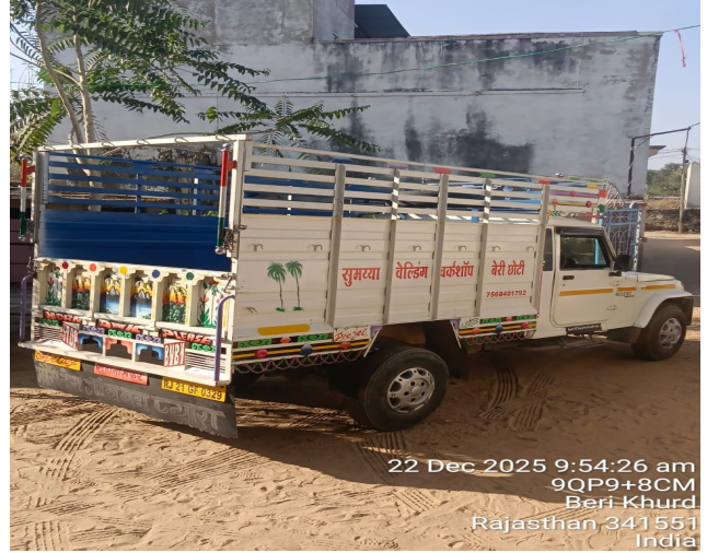
22 Dec 2025 9:54:26 am 9QP9+8CM Beri Khurd Rajasthan 341551 India