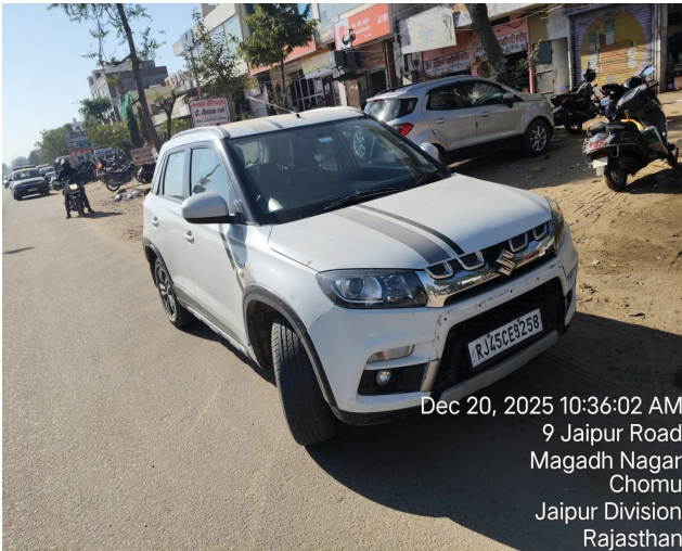
Dec 20, 2025 10:36:02 AM 9 Jaipur Road Magadh Nagar Chomu Jaipur Division Rajasthan