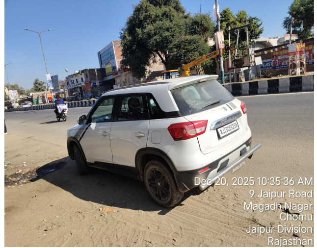
Dec 20, 2025 10:35:36 AM 9 Jaipur Road Magadh Nagar Chomu Jaipur Division Rajasthan