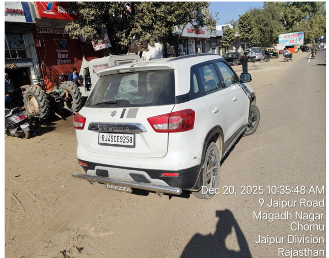
Dec 20, 2025 10:35:48 AM 9 Jaipur Road Magadh Nagar Chomu Jaipur Division Rajasthan