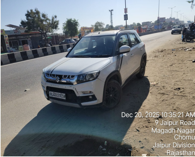
Dec 20, 2025 10:35:21 AM 9 Jaipur Road Magadh Nagar Chomu Jaipur Division Rajasthan

Surveyor & Loss Assessor (SLA / 65869 Valid up to 27-09-27)