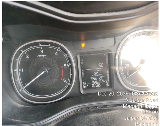
Dec 20, 2025 10:36:53 AM 9 Jaipur Road Magadh Nagar Chomu Jaipur Division Rajasthan