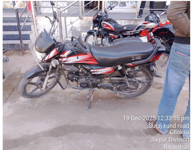
19-Dec-2025 12:33:55 pm Suraj kund road Chaksu Jaipur Division Rajasthan