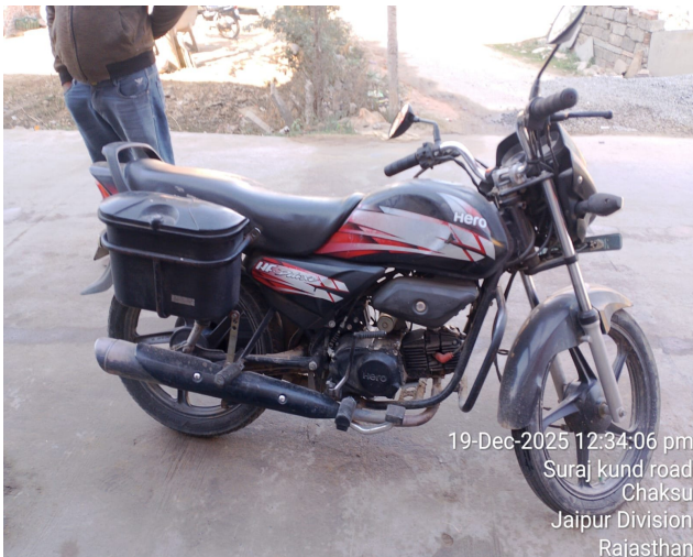
19-Dec-2025 12:34:06 pm Suraj kund road Chaksu Jaipur Division Rajasthan