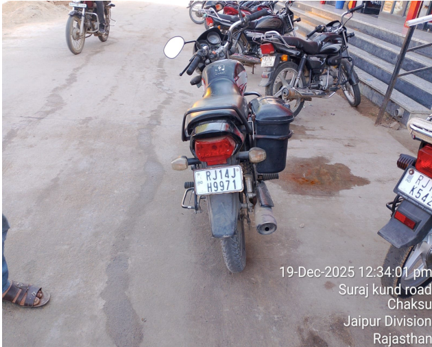
19-Dec-2025 12:34:01 pm Suraj kund road Chaksu Jaipur Division Rajasthan

Surveyor & Loss Assessor (SLA / 65869 Valid up to 27-09-27)