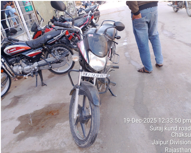
19-Dec-2025 12:33:50 pm Suraj kund road Chaksu Jaipur Division Rajasthan