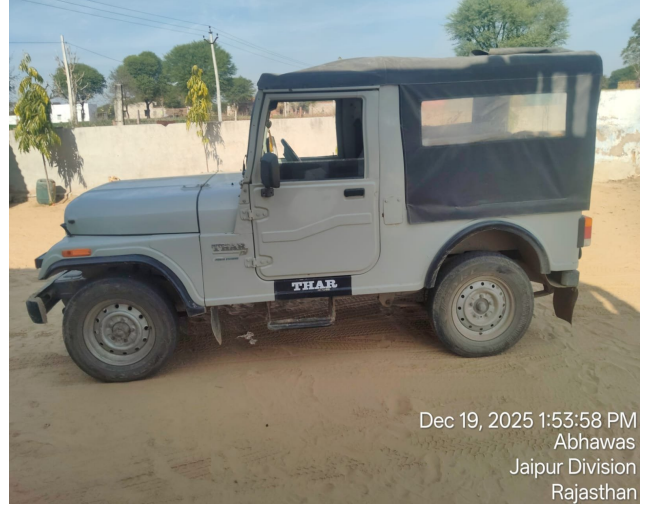
Dec 19, 2025 1:53:58 PM Abhawas Jaipur Division Rajasthan