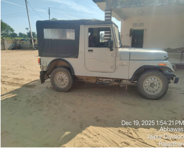
Dec 19, 2025 1:54:21 PM Abhawas Jaipur Division Rajasthan

Surveyor & Loss Assessor (SLA / 65869 Valid up to 27-09-27)