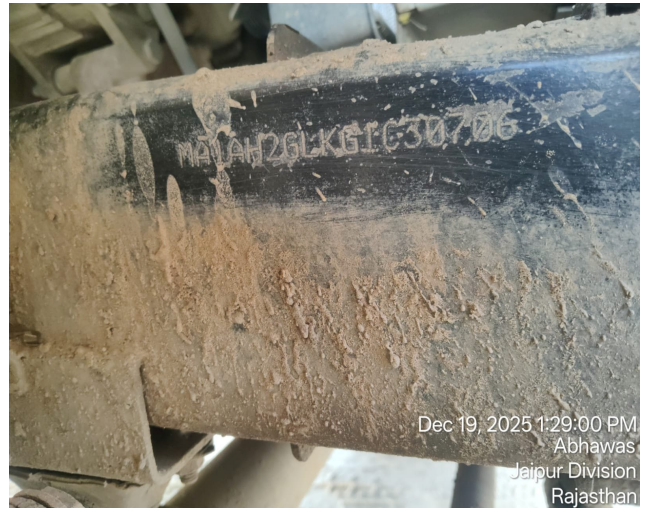
Dec 19, 2025 1:29:00 PM Abhawas Jaipur Division Rajasthan