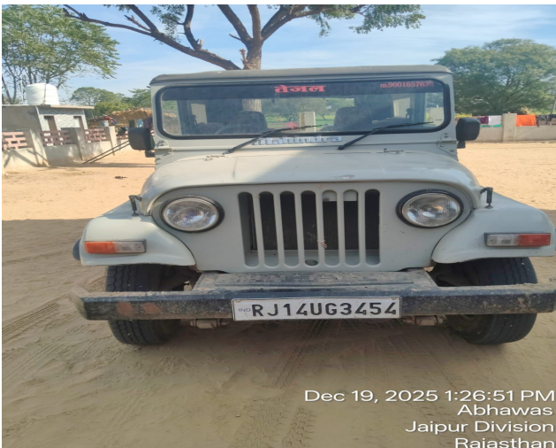
Dec 19, 2025 1:26:51 PM Abhawas Jaipur Division Rajasthan