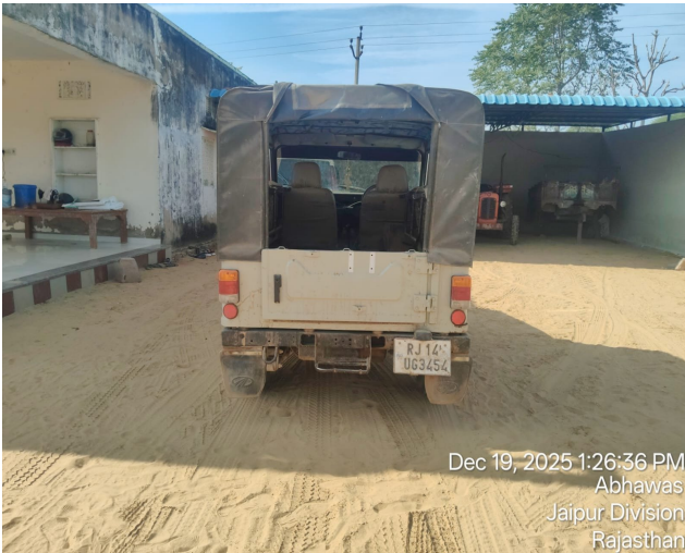
Dec 19, 2025 1:26:36 PM Abhawas Jaipur Division Rajasthan