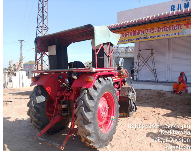
18-Dec-2025 1:54:47 pm Kotkhawda Jaipur Division Rajasthan