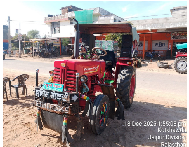
18-Dec-2025 1:55:08 pm Kotkhawda Jaipur Division Rajasthan