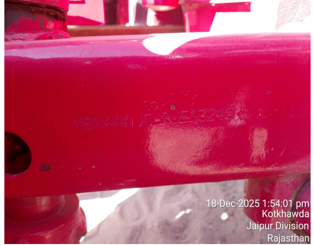
18-Dec-2025 1:54:01 pm Kotkhawda Jaipur Division Rajasthan