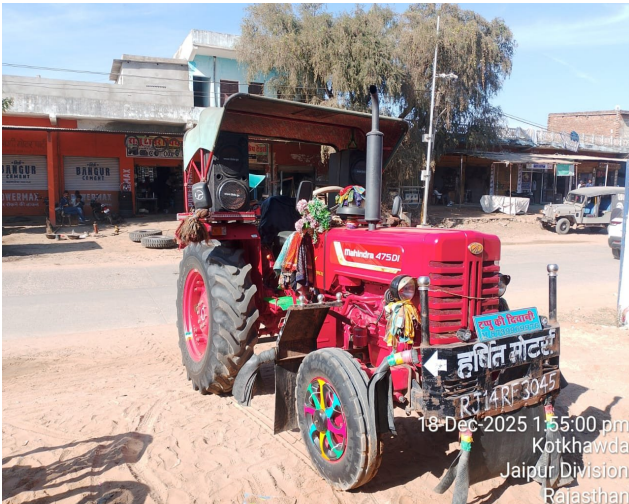
18-Dec-2025 1:55:00 pm Kotkhawda Jaipur Division Rajasthan