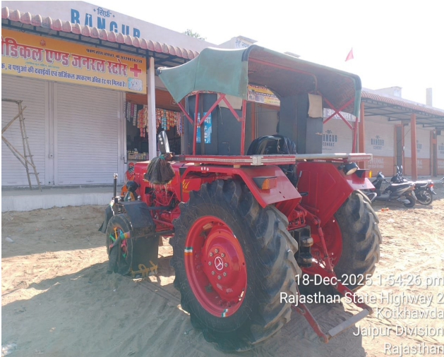
18-Dec-2025 1:54:26 pm Rajasthan State Highway 2 Kotkhawda Jaipur Division Rajasthan