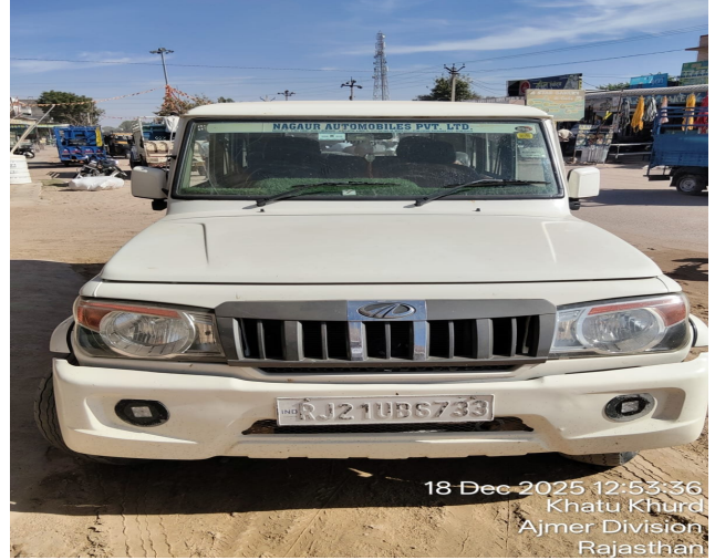
18 Dec 2025 12:53:36 Khatu Khurd Ajmer Division Rajasthan