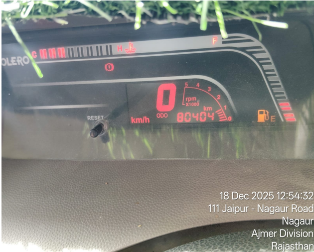
18 Dec 2025 12:54:32 111 Jaipur - Nagaur Road Nagaur Ajmer Division Rajasthan