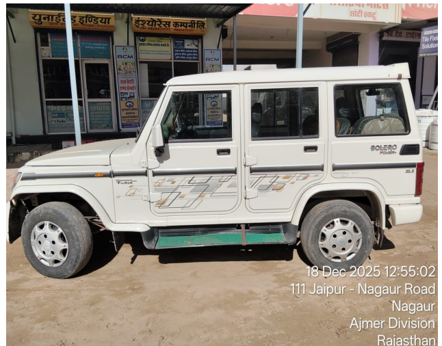
18 Dec 2025 12:55:02 111 Jaipur - Nagaur Road Nagaur Ajmer Division Rajasthan