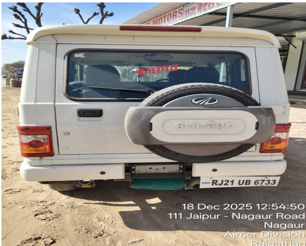
18 Dec 2025 12:54:50 111 Jaipur - Nagaur Road Nagaur Ajmer Division Rajasthan