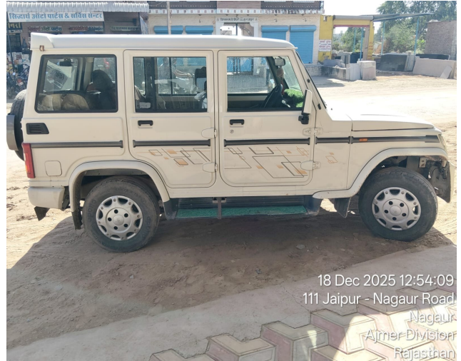
18 Dec 2025 12:54:09 111 Jaipur - Nagaur Road Nagaur Ajmer Division Rajasthan