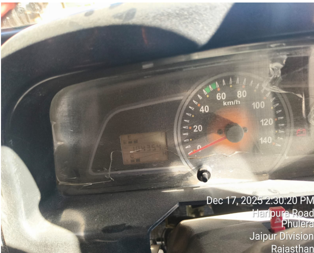
Dec 17, 2025 2:30:20 PM Haripura Road Phulera Jaipur Division Rajasthan