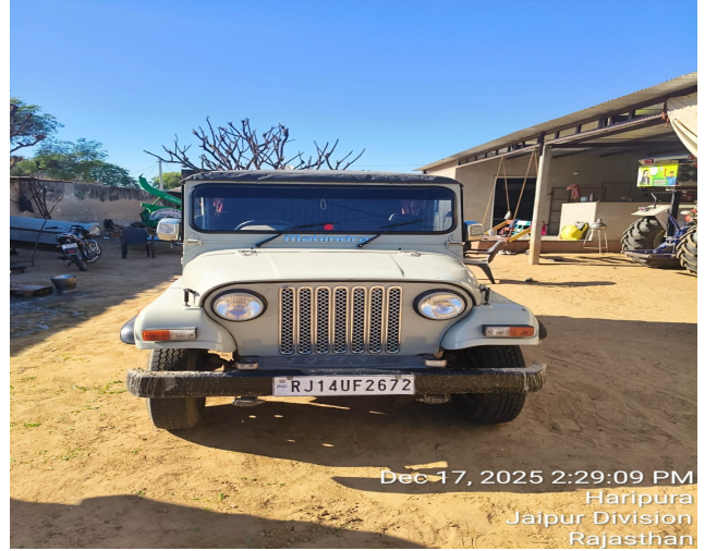
Dec 17, 2025 2:29:09 PM Haripura Phulera Jaipur Division Rajasthan