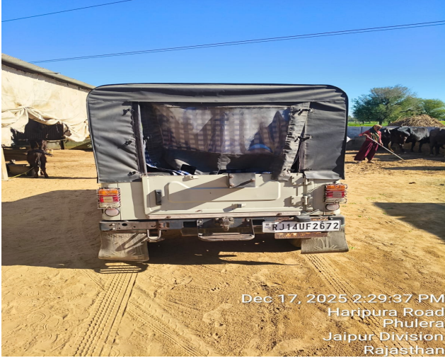
Dec 17, 2025 2:29:37 PM Haripura Road Phulera Jaipur Division Rajasthan

Surveyor & Loss Assessor (SLA / 65869 Valid up to 27-09-27)