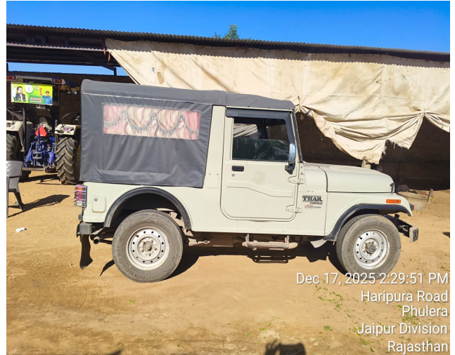
Dec 17, 2025 2:29:51 PM Haripura Road Phulera Jaipur Division Rajasthan