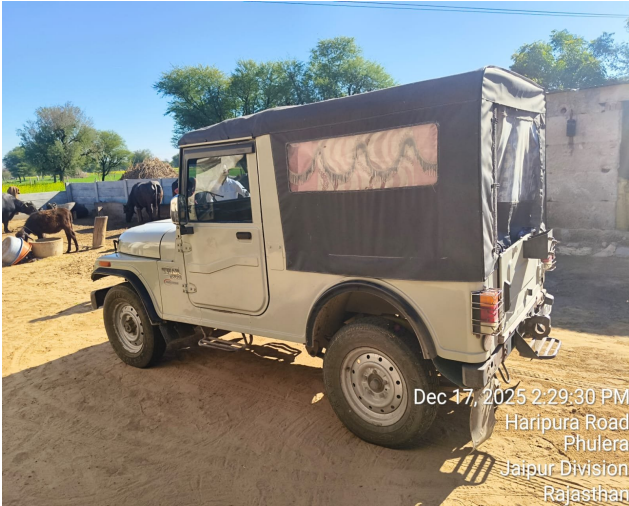
Dec 17, 2025 2:29:30 PM Haripura Road Phulera Jaipur Division Rajasthan