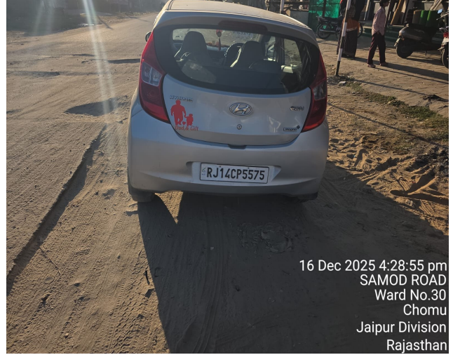
16 Dec 2025 4:28:55 pm SAMOD ROAD Ward No.30 Chomu Jaipur Division Rajasthan