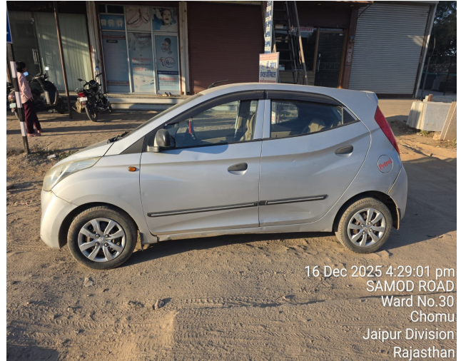
16 Dec 2025 4:29:01 pm SAMOD ROAD Ward No.30 Chomu Jaipur Division Rajasthan