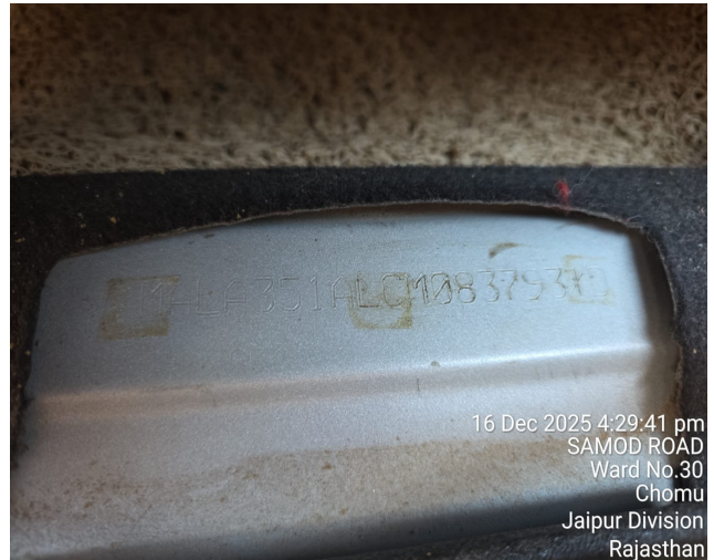
16 Dec 2025 4:29:41 pm SAMOD ROAD Ward No.30 Chomu Jaipur Division Rajasthan