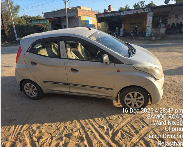
16 Dec 2025 4:28:47 pm SAMOD ROAD Ward No.30 Chomu Jaipur Division Rajasthan