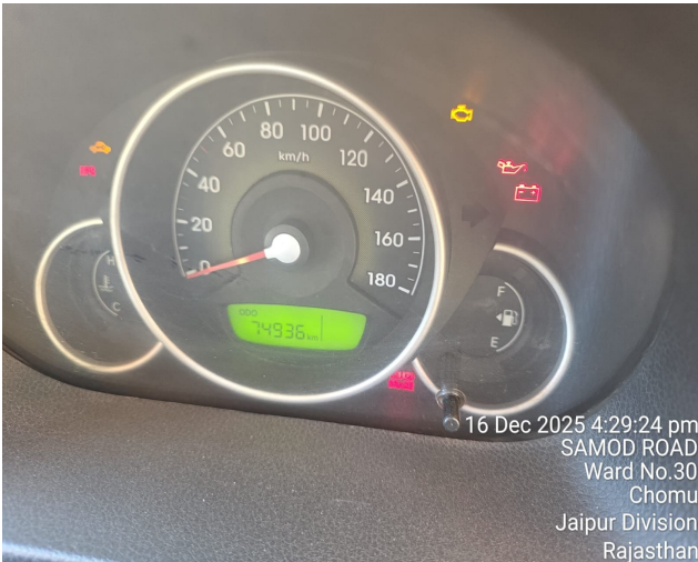
16 Dec 2025 4:29:24 pm SAMOD ROAD Ward No.30 Chomu Jaipur Division Rajasthan