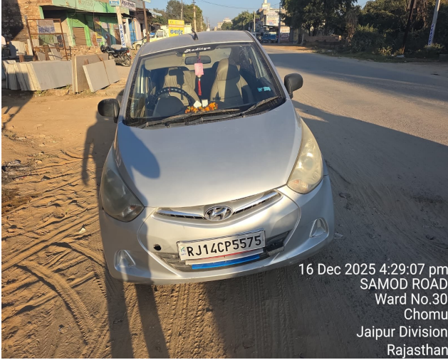
16 Dec 2025 4:29:07 pm SAMOD ROAD Ward No.30 Chomu Jaipur Division Rajasthan

Surveyor & Loss Assessor (SLA / 65869 Valid up to 27-09-27)