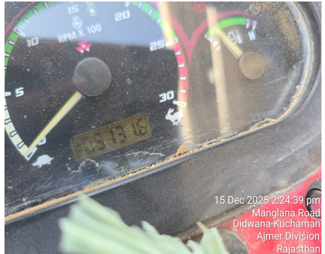
15 Dec 2025 2:24:39 pm Manglana Road Didwana-Kuchaman Ajmer Division Rajasthan