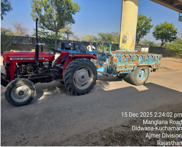
15 Dec 2025 2:24:02 pm Manglana Road Didwana-Kuchaman Ajmer Division Rajasthan

Surveyor & Loss Assessor (SLA / 65869 Valid up to 27-09-27)