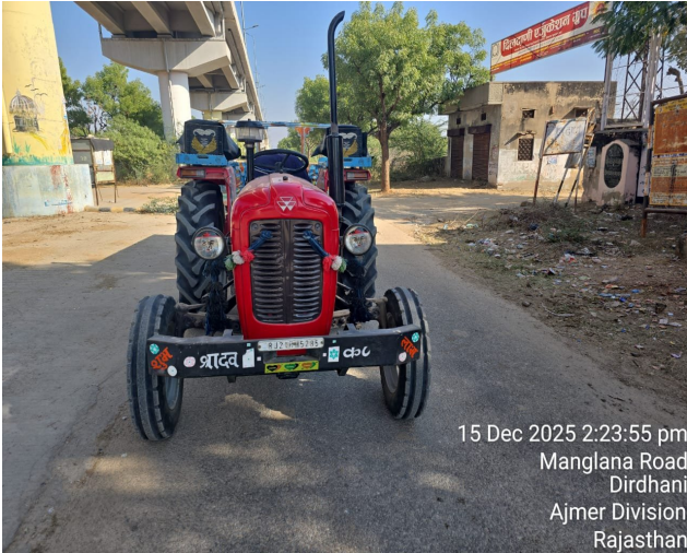
15 Dec 2025 2:23:55 pm Manglana Road Dirdhani Ajmer Division Rajasthan