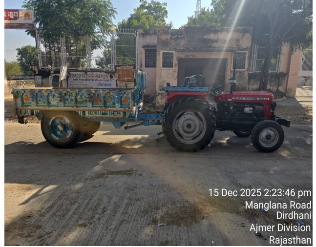
15 Dec 2025 2:23:46 pm Manglana Road Dirdhani Ajmer Division Rajasthan