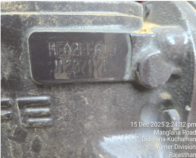
15 Dec 2025 2:24:32 pm Manglana Road Didwana-Kuchaman Ajmer Division Rajasthan