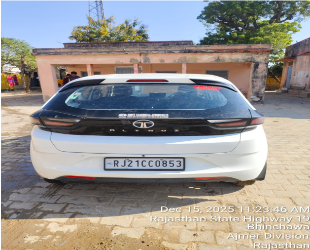
Dec 15, 2025 11:23:46 AM Rajasthan State Highway 19 Bhinchawa Ajmer Division Rajasthan