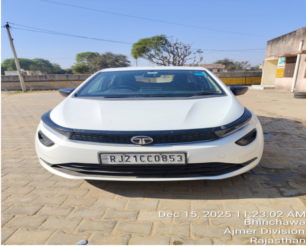
Dec 15, 2025 11:23:02 AM Bhinchawa Ajmer Division Rajasthan

Surveyor & Loss Assessor (SLA / 65869 Valid up to 27-09-27)