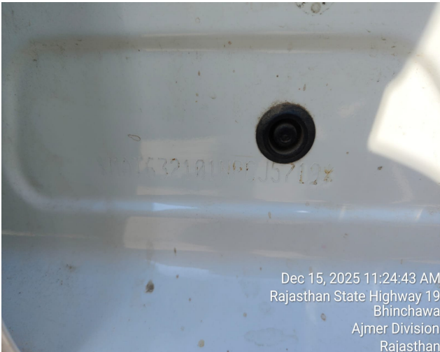
Dec 15, 2025 11:24:43 AM Rajasthan State Highway 19 Bhinchawa Ajmer Division Rajasthan