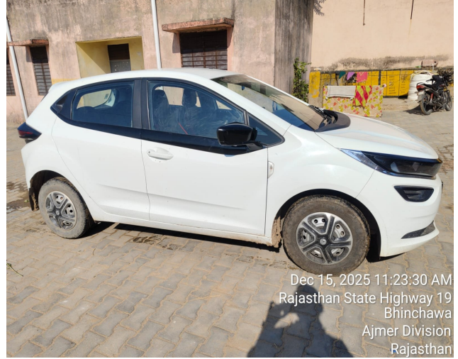
Dec 15, 2025 11:23:30 AM Rajasthan State Highway 19 Bhinchawa Ajmer Division Rajasthan