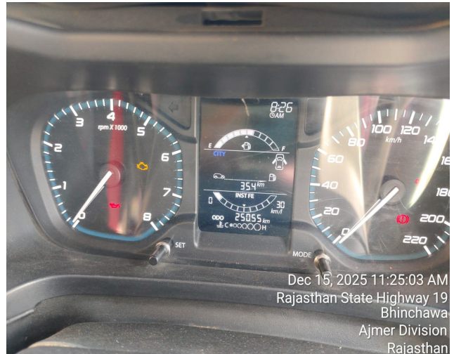
Dec 15, 2025 11:25:03 AM Rajasthan State Highway 19 Bhinchawa Ajmer Division Rajasthan