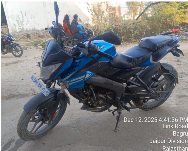
Dec 12, 2025 4:41:36 PM Link Road Bagru Jaipur Division Rajasthan