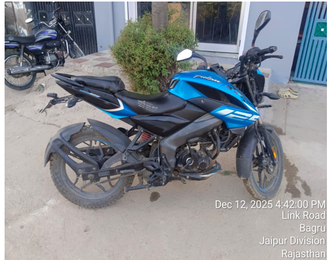
Dec 12, 2025 4:42:00 PM Link Road Bagru Jaipur Division Rajasthan