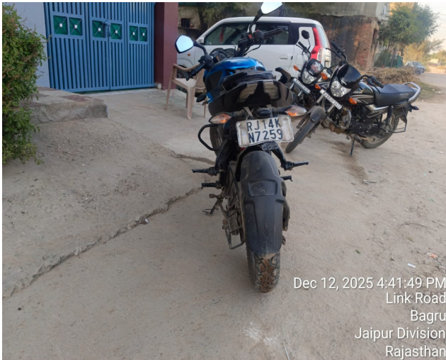
Dec 12, 2025 4:41:49 PM Link Road Bagru Jaipur Division Rajasthan