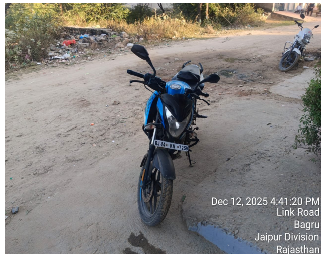
Dec 12, 2025 4:41:20 PM Link Road Bagru Jaipur Division Rajasthan