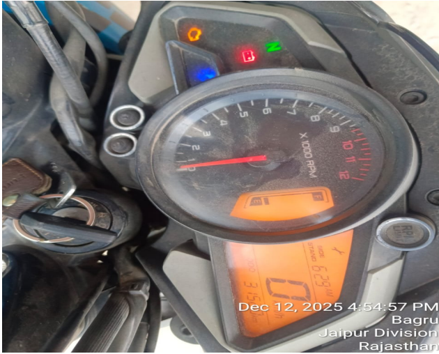
Dec 12, 2025 4:54:57 PM Bagru Jaipur Division Rajasthan

Surveyor & Loss Assessor (SLA / 65869 Valid up to 27-09-27)