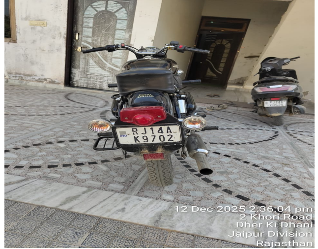
12 Dec 2025 2:36:04 pm 2 Khori Road Dher Ki Dhani Jaipur Division Rajasthan