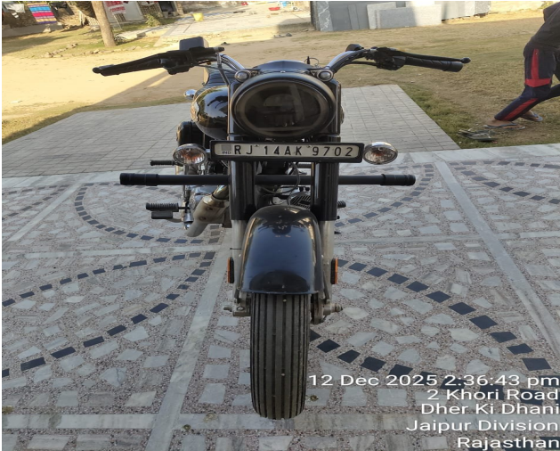
12 Dec 2025 2:36:43 pm 2 Khori Road Dher Ki Dhani Jaipur Division Rajasthan