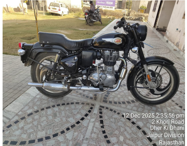
12 Dec 2025 2:35:56 pm 2 Khori Road Dher Ki Dhani Jaipur Division Rajasthan