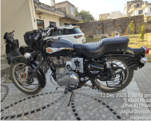
12 Dec 2025 2:36:13 pm 2 Khori Road Dher Ki Dhani Jaipur Division Rajasthan

Surveyor & Loss Assessor (SLA / 65869 Valid up to 27-09-27)