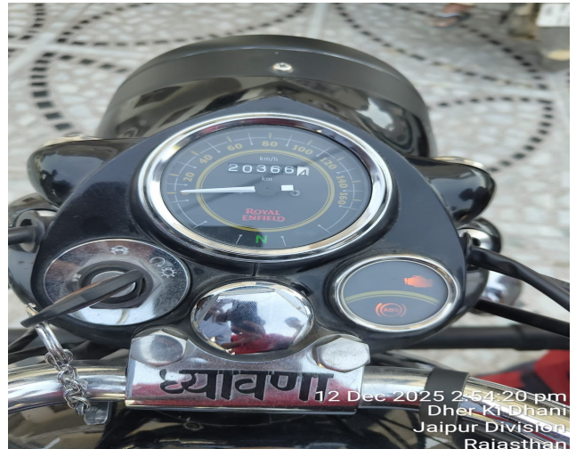
12 Dec 2025 2:54:20 pm Dher Ki Dhani Jaipur Division Rajasthan