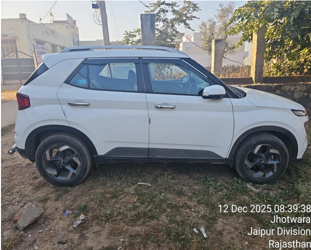
12 Dec 2025 08:39:38 Jhotwara Jaipur Division Rajasthan