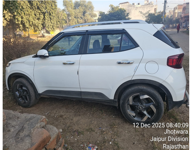
12 Dec 2025 08:40:09 Jhotwara Jaipur Division Rajasthan