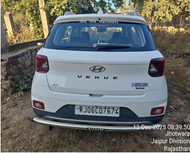
12 Dec 2025 08:39:50 Jhotwara Jaipur Division Rajasthan

Surveyor & Loss Assessor (SLA / 65869 Valid up to 27-09-27)