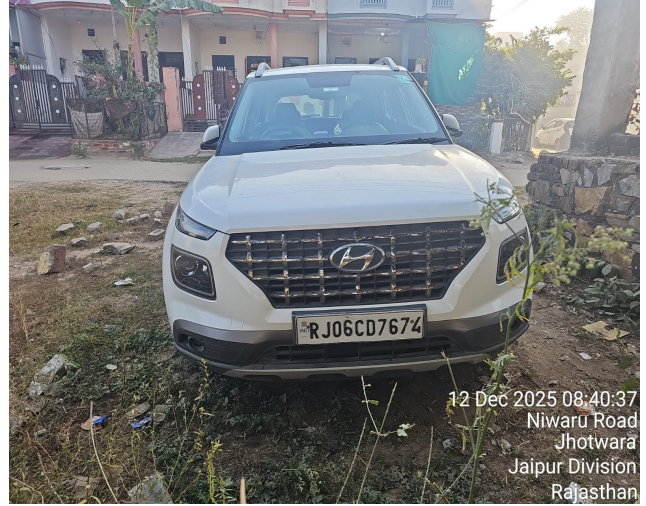
12 Dec 2025 08:40:37 Niwaru Road Jhotwara Jaipur Division Rajasthan