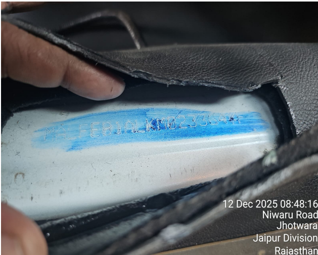
12 Dec 2025 08:48:16 Niwaru Road Jhotwara Jaipur Division Rajasthan