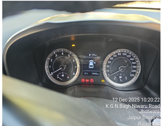
12 Dec 2025 10:20:22 K.G.N.Bagh Niwaru Road Jhotwara Jaipur Division Rajasthan