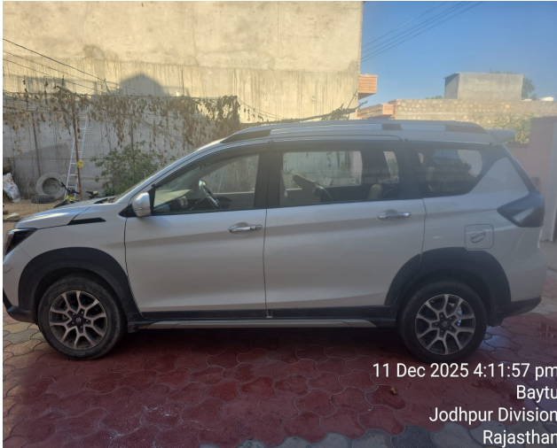
11 Dec 2025 4:11:57 pm Baytu Jodhpur Division Rajasthan