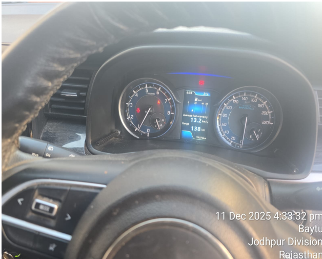
11 Dec 2025 4:33:32 pm Baytu Jodhpur Division Rajasthan