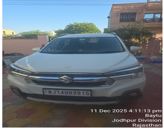
11 Dec 2025 4:11:13 pm Baytu Jodhpur Division Rajasthan