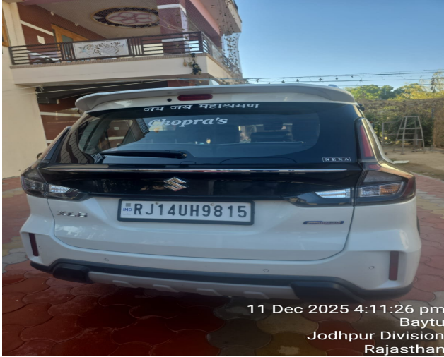
11 Dec 2025 4:11:26 pm Baytu Jodhpur Division Rajasthan

Surveyor & Loss Assessor (SLA / 65869 Valid up to 27-09-27)