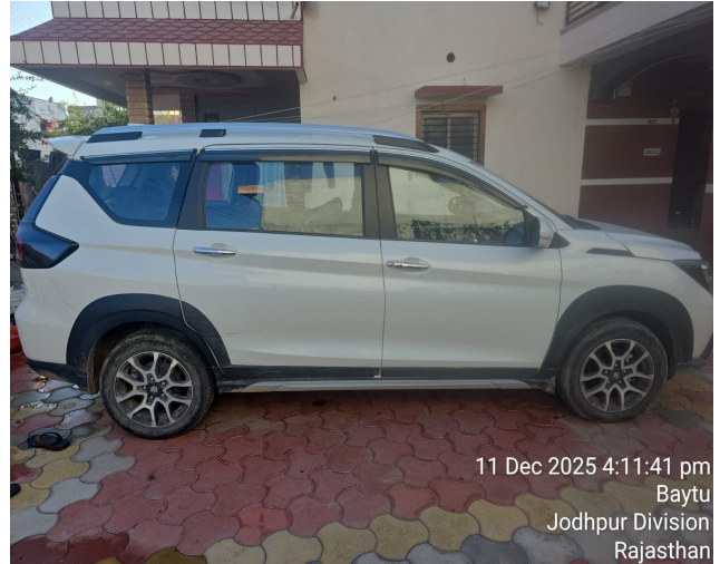
11 Dec 2025 4:11:41 pm Baytu Jodhpur Division Rajasthan