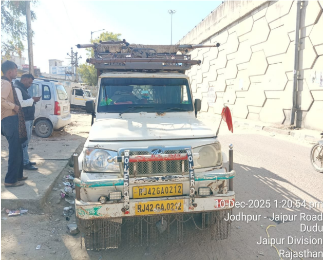
10-Dec-2025 1:20:54 pm Jodhpur - Jaipur Road Dudu Jaipur Division Rajasthan

Surveyor & Loss Assessor (SLA / 65869 Valid up to 27-09-27)