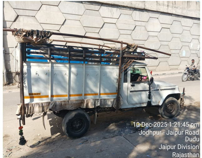
10-Dec-2025 1:21:45 pm Jodhpur - Jaipur Road Dudu Jaipur Division Rajasthan