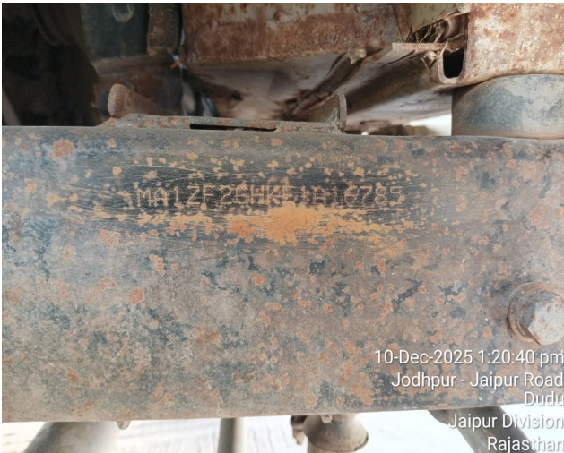
10-Dec-2025 1:20:40 pm Jodhpur - Jaipur Road Dudu Jaipur Division Rajasthan