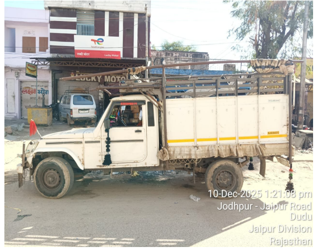
10-Dec-2025 1:21:08 pm Jodhpur - Jaipur Road Dudu Jaipur Division Rajasthan