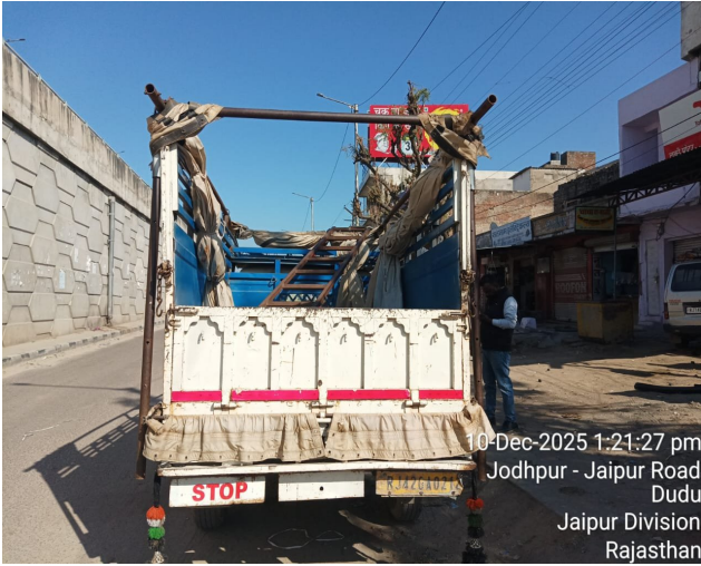
10-Dec-2025 1:21:27 pm Jodhpur - Jaipur Road Dudu Jaipur Division Rajasthan